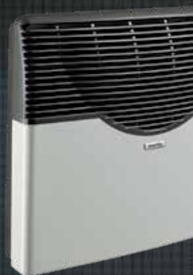
MDV20P / MDV20N