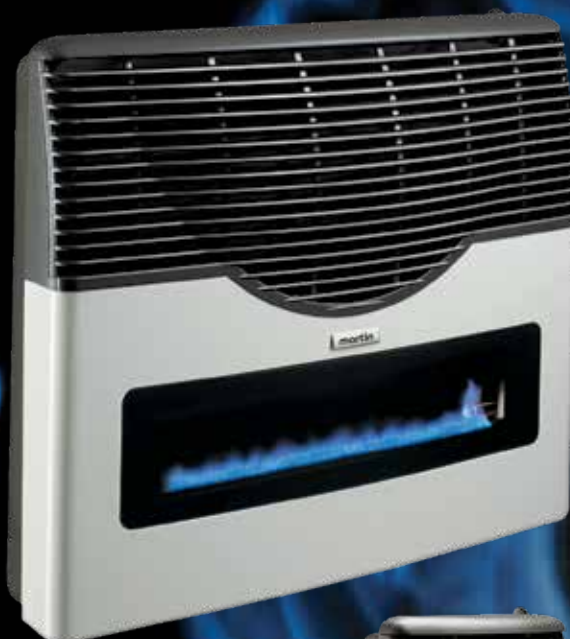
MDV20VP / MDV20VN