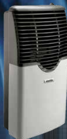
MDV8P / MDV8N