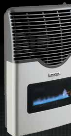
MDV12VP / MDV12VN