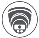
4K Dome Security Camera