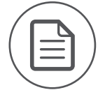
Quick Start Guides