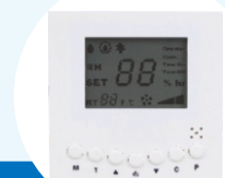
Optional Remote Control