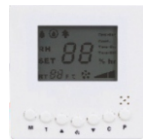
Optional Remote Control