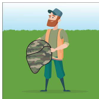
2. Hold one of 2 rings sets of steel.