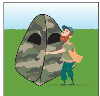
4. Spread the Blind and stake down. High wind tie-downs are included (if needed)