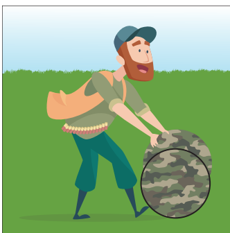
1. Remove Blind from case.