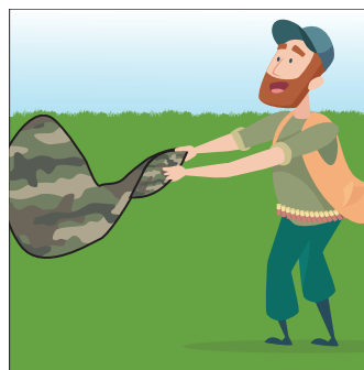
3. Let other two pop open.