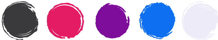
BLACK MAGENTA VIOLET COBALT BLUE WHITE