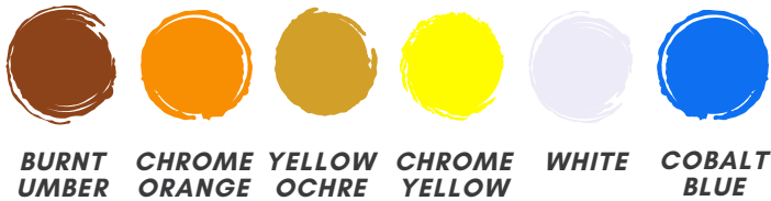
BURNT UMBER CHROME ORANGE OCHRE CHROME YELLOW WHITE COBALT BLUE