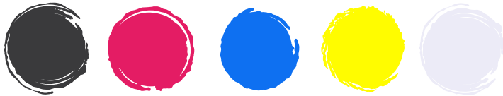
BLACK MAGENTA COBALT BLUE CHROME YELLOW WHITE