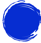
ULTRA- MARINE BLUE