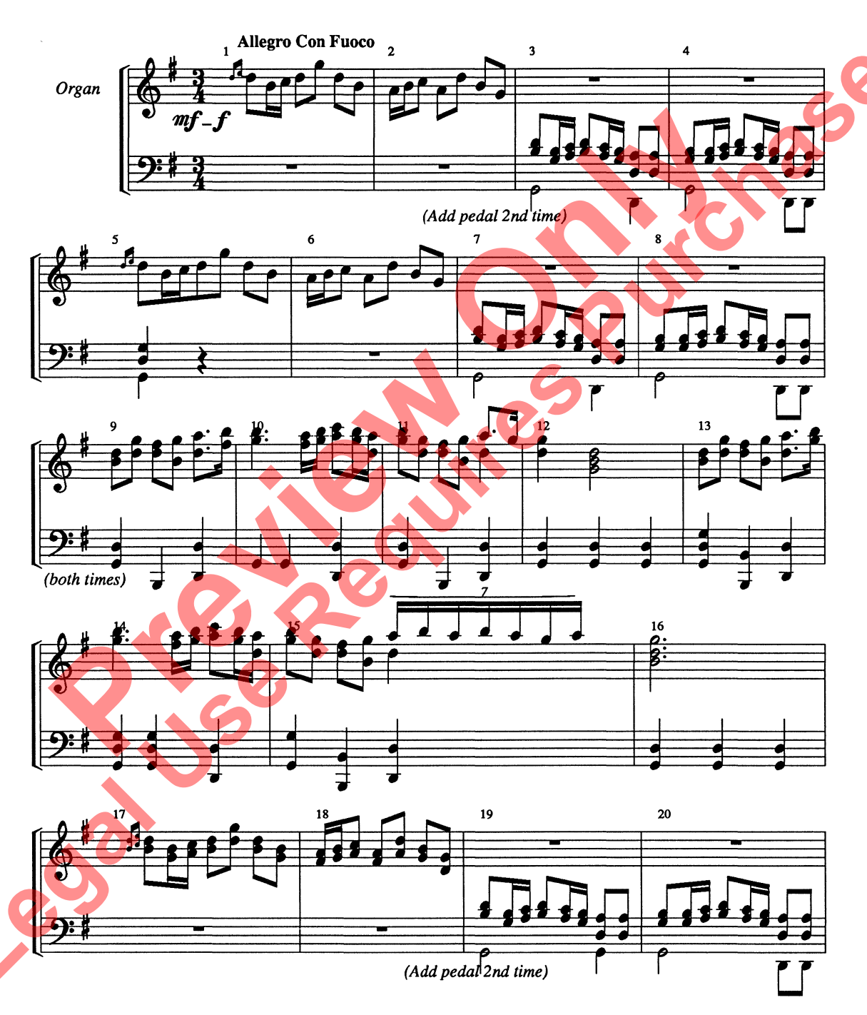
© Copyright 1990 by CandelaWorks Music (ASCAP), a division of Jubilate Music Group, LLC. P.O. Box 3607, Brentwood, TN 37024. All Rights Reserved. www.jubilatemusic.com