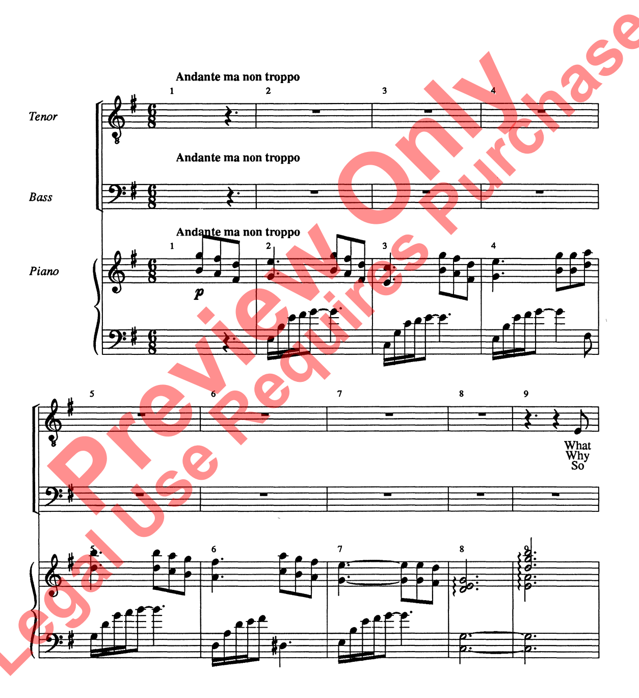
© Copyright 1990 by CandelaWorks Music (ASCAP), a division of Jubilate Music Group, LLC. P.O. Box 3607, Brentwood, TN 37024. All Rights Reserved. www.jubilatemusic.com