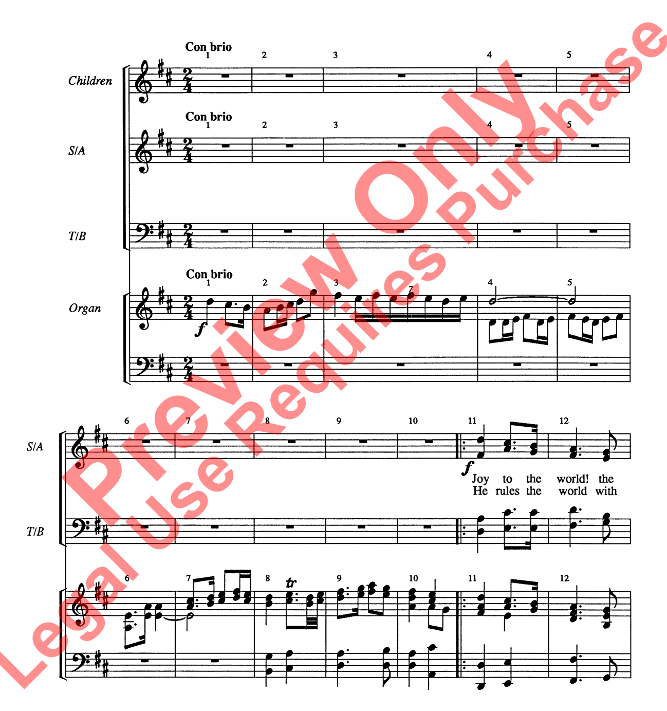
© Copyright 1990 by CandelaWorks Music (ASCAP), a division of Jubilate Music Group, LLC. P.O. Box 3607, Brentwood, TN 37024. All Rights Reserved. www.jubilatemusic.com