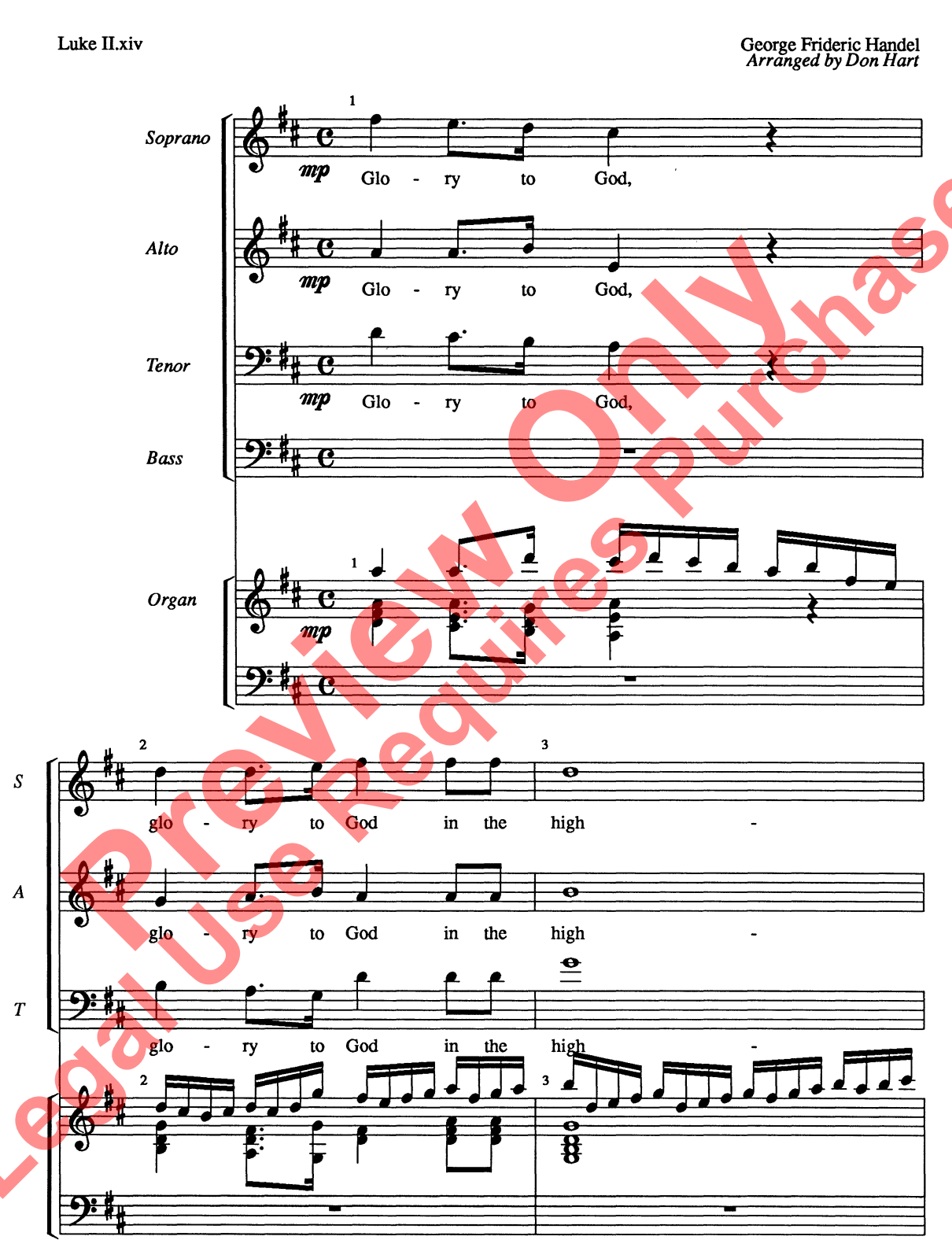
© Copyright 1990 by CandelaWorks Music (ASCAP), a division of Jubilate Music Group, LLC. P.O. Box 3607, Brentwood, TN 37024. All Rights Reserved.