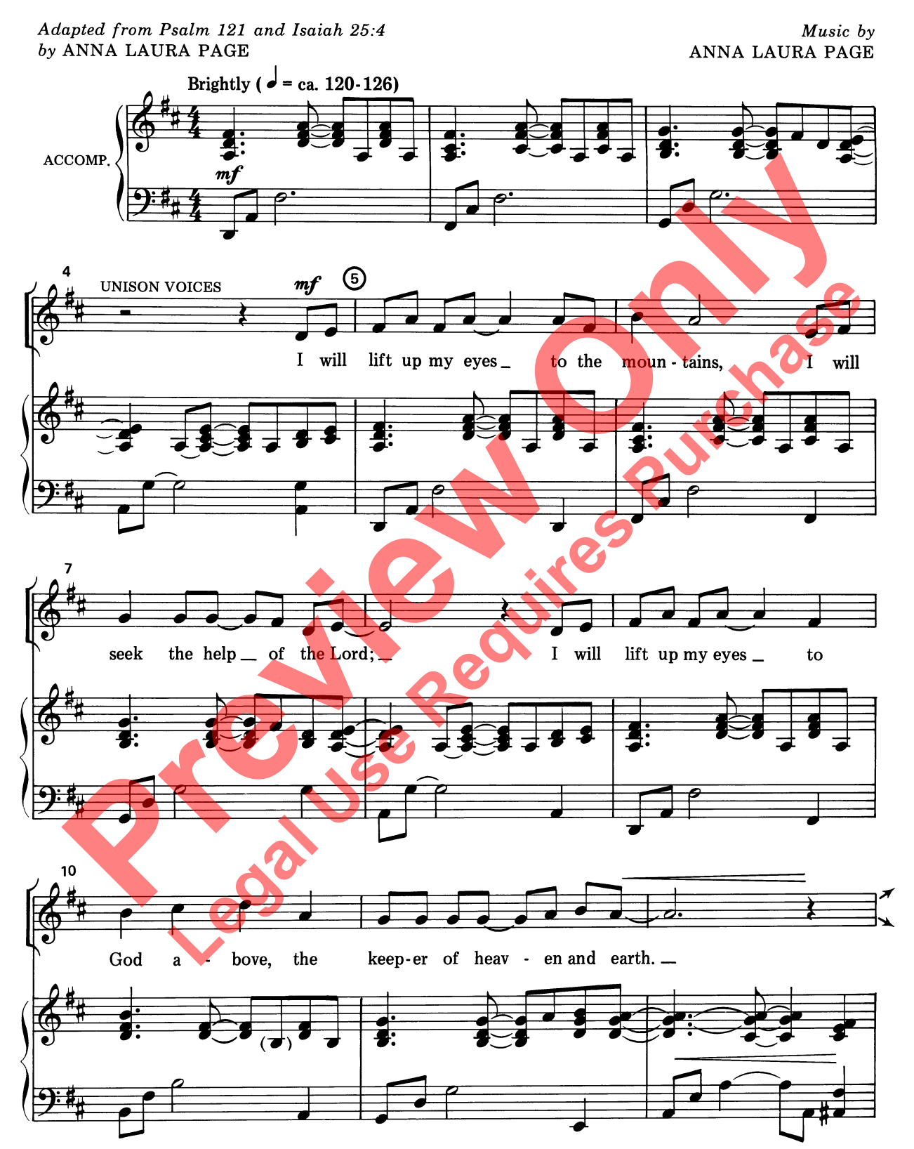
Copyright © 1995 Jubilate Music Group, LLC. All rights reserved. Printed in USA. THE CCLI LICENSE DOES NOT GRANT PERMISSION TO PHOTOCOPY THIS MUSIC.