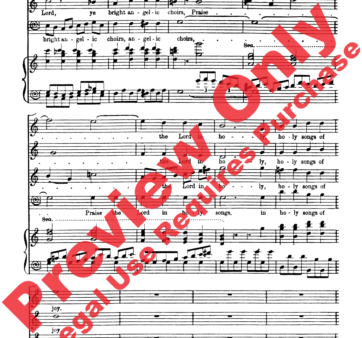
Beethoven's "Mount of Olives."