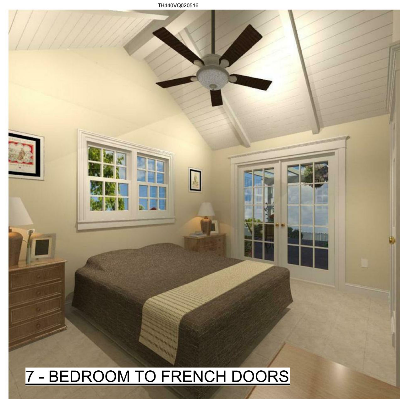
7 - BEDROOM TO FRENCH DOORS