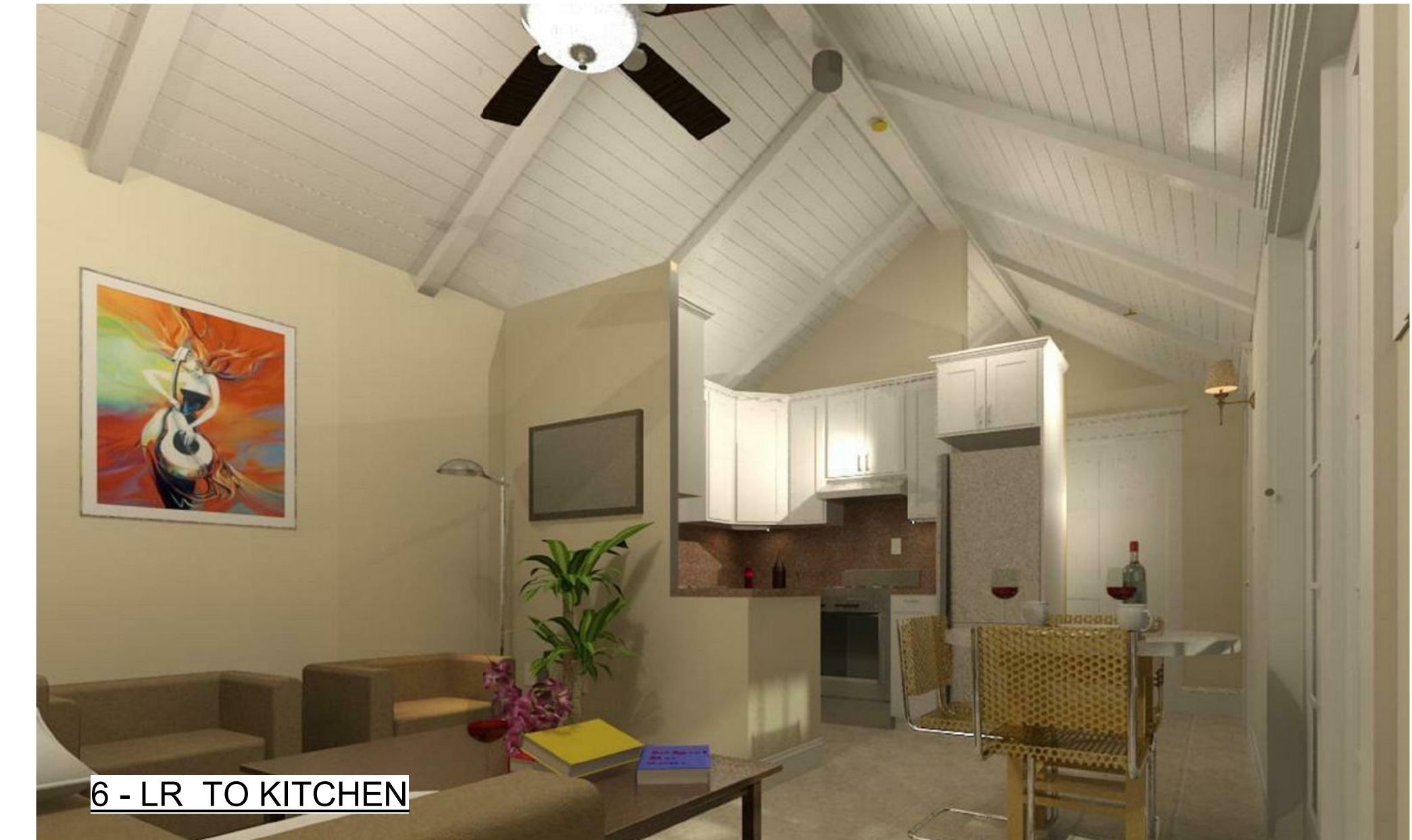
6 - LR TO KITCHEN