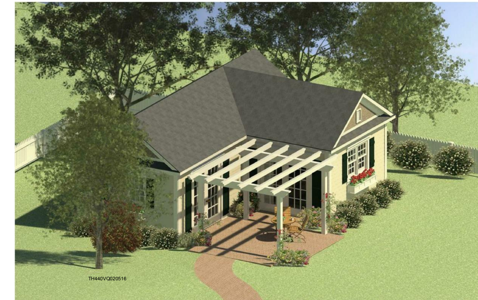
3 - EXTERIOR ARIEL VIEW