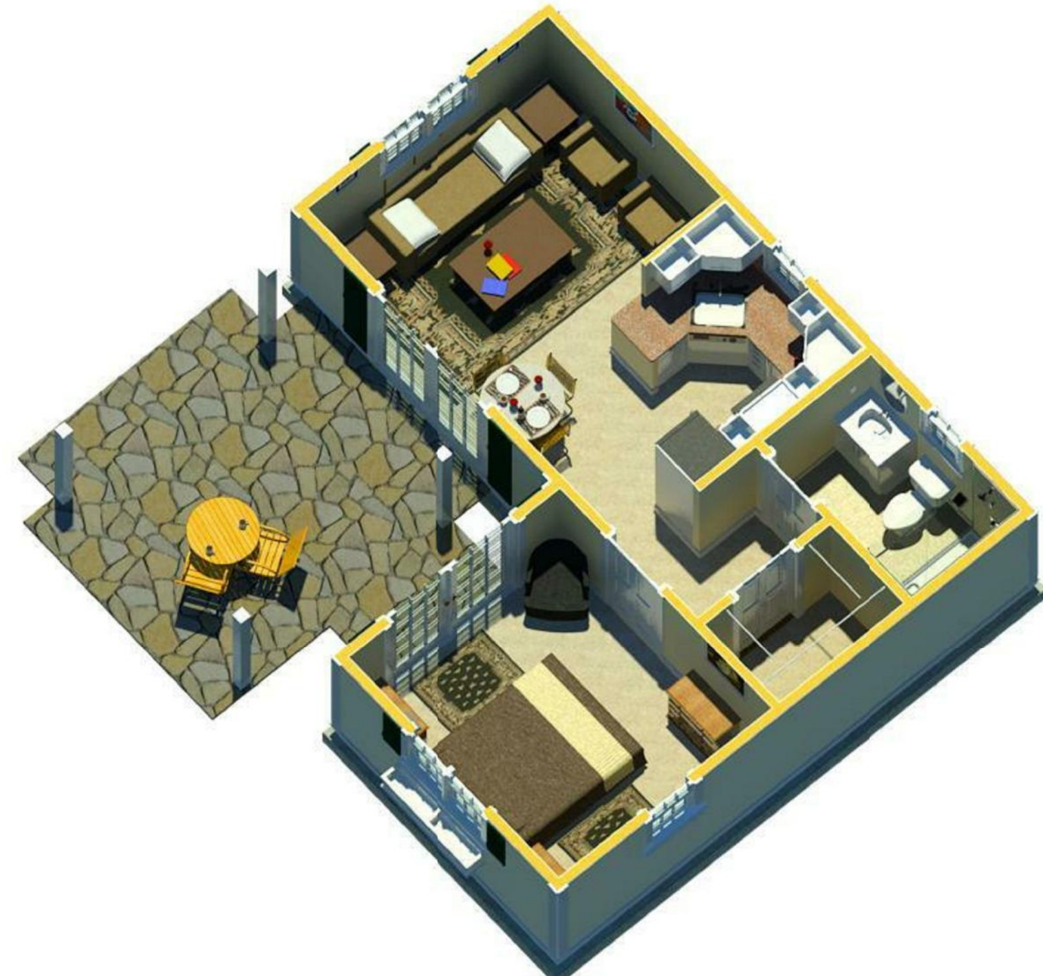
4 - CUTAWAY FLOOR PLAN FRONT