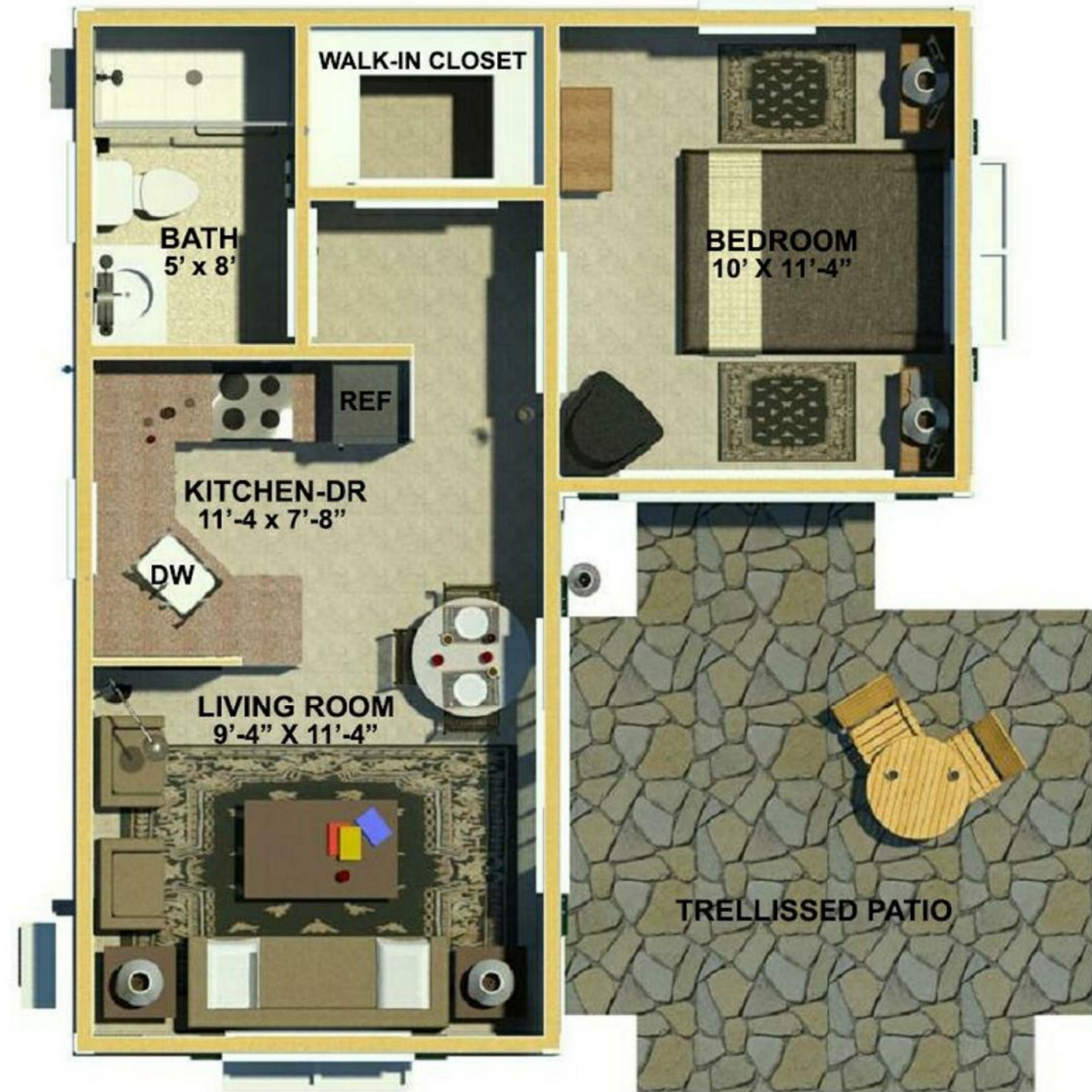
5 - FLOOR PLAN