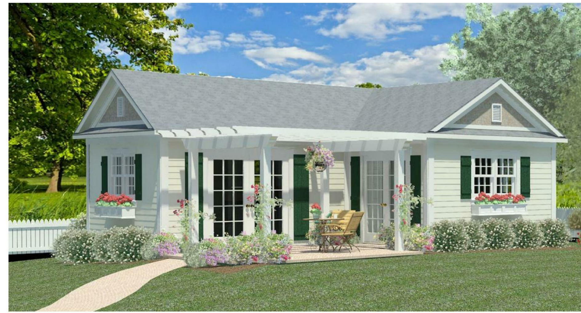
2 - EXTERIOR FRONT VIEW