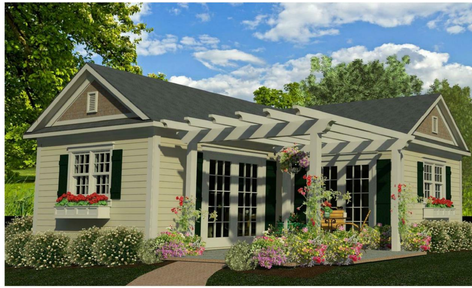
1 - EXTERIOR ENTRY @ PATIO