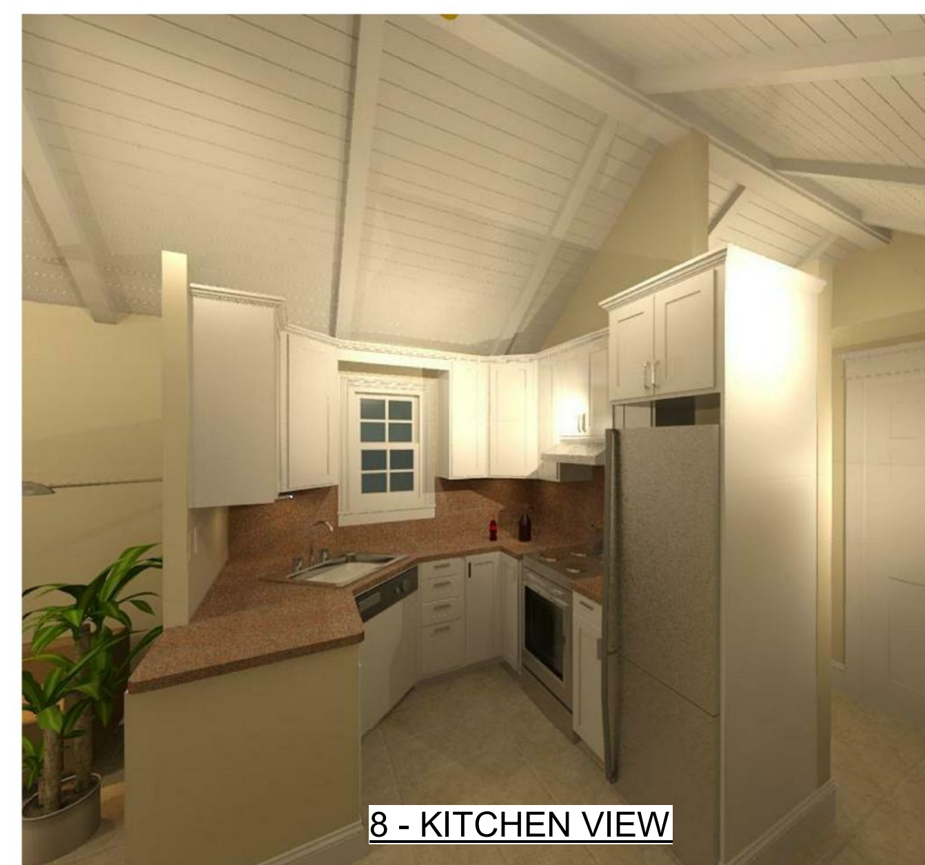
8 - KITCHEN VIEW