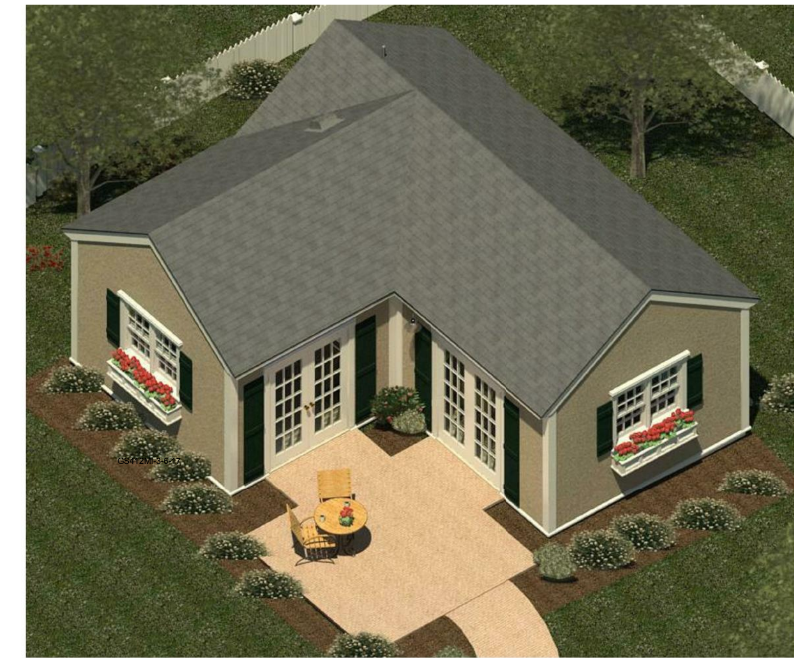
3 - ARIEL VIEW NO TRELLIS