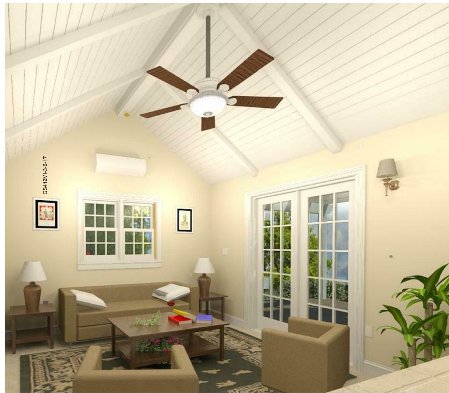
1- SITTING ROOM FROM DESK