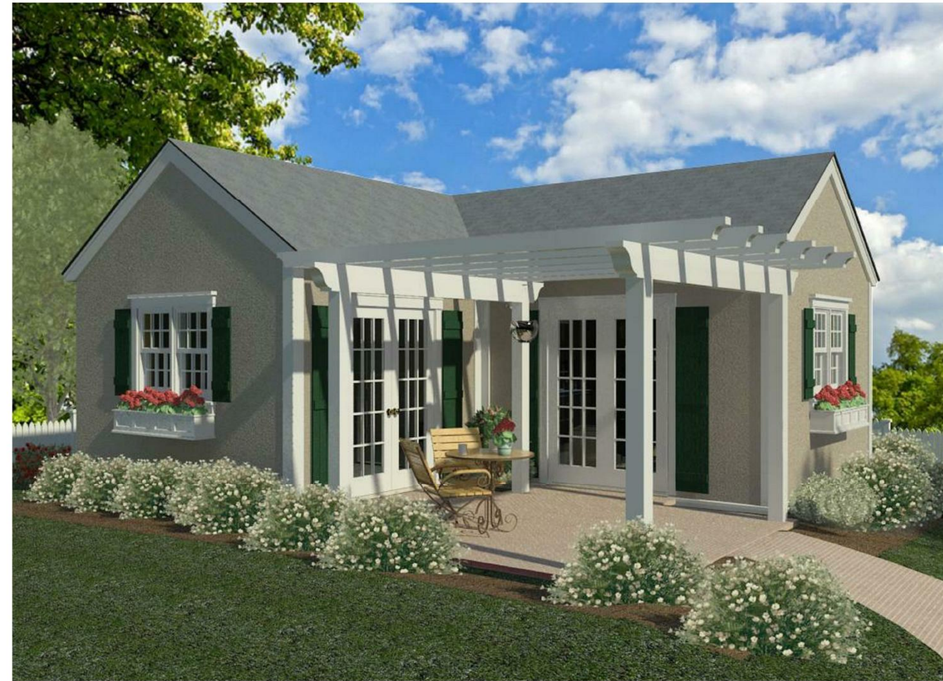
2 - EXTERIOR FRONT VIEW WITH TRELLIS