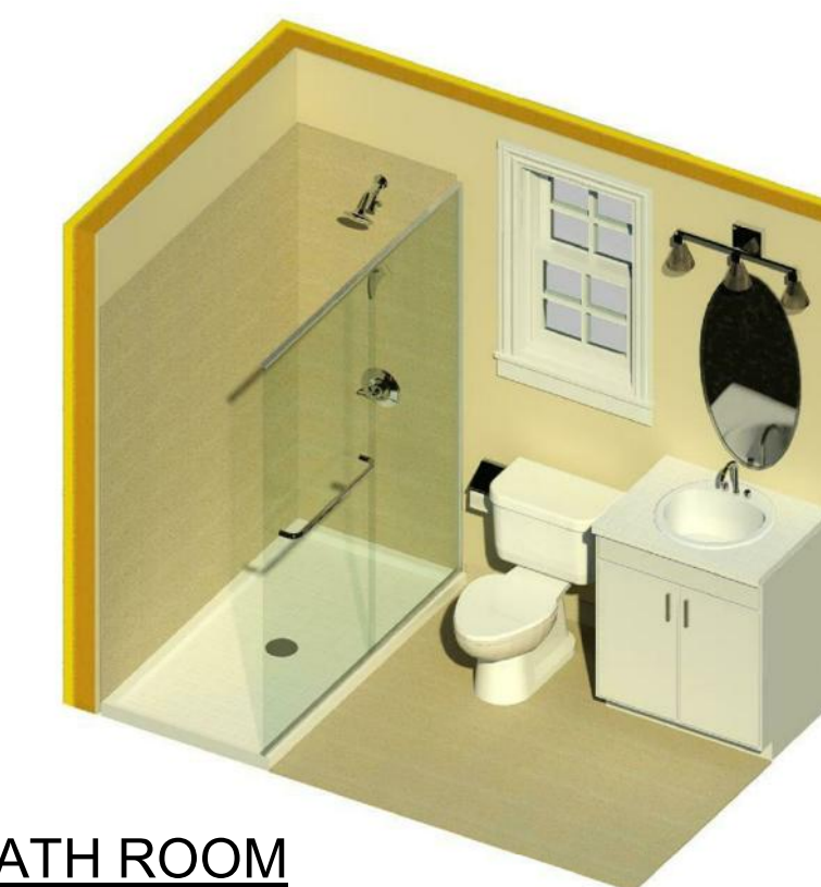
8 - BATH ROOM