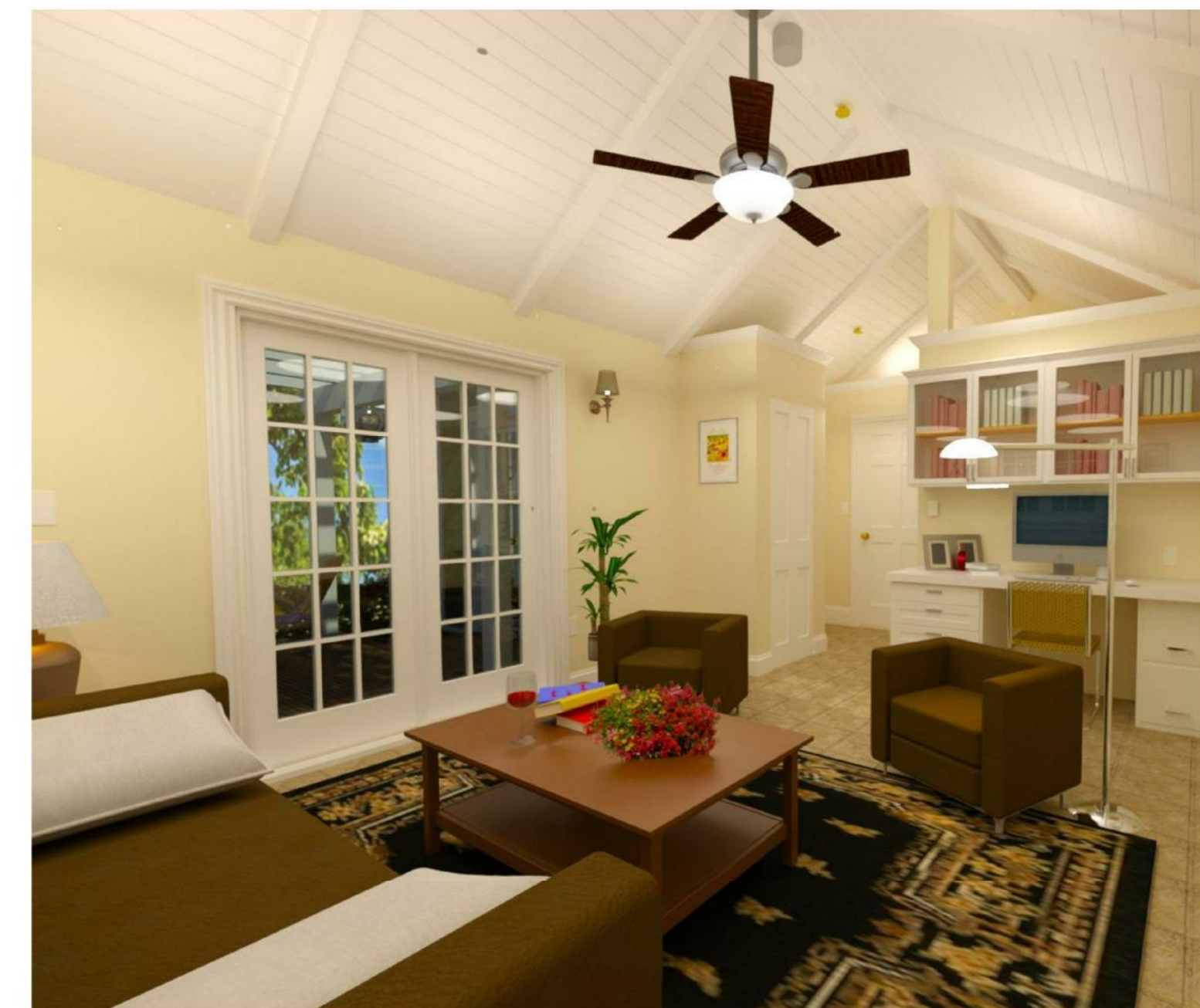
6 - SITTING ROOM FROM COUCH