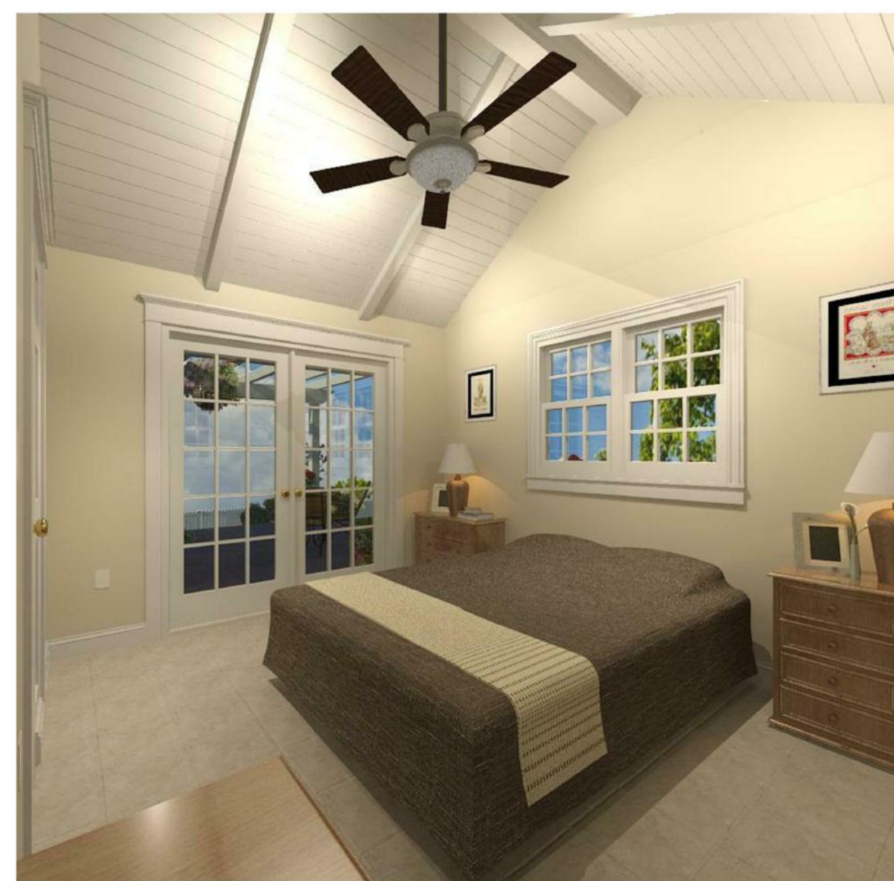
7- BEDROOM VIEW