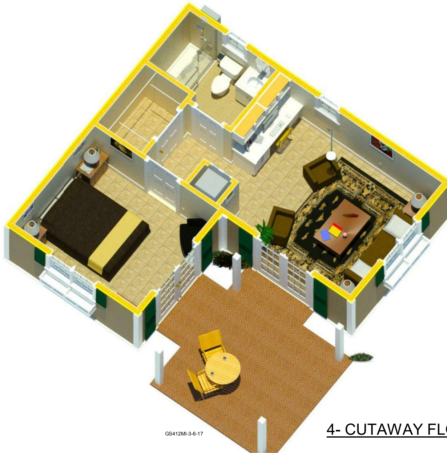
4- CUTAWAY FLOOR PLAN