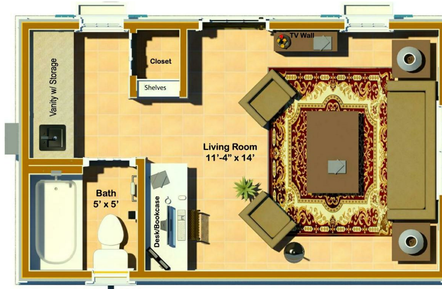
Floor Plan with Desk/Bookcase