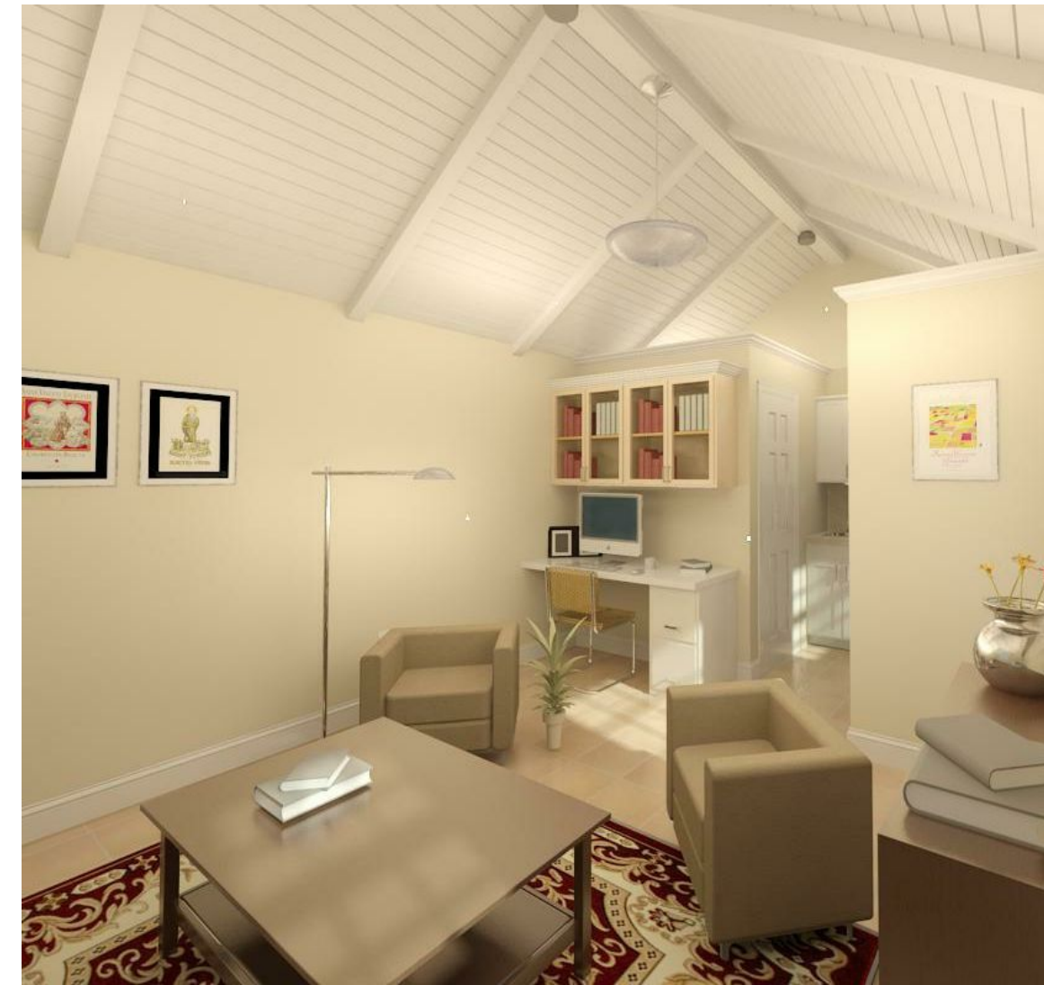
Interior View Toward Desk