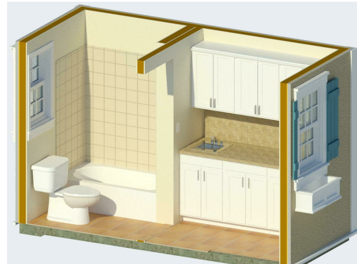
View of Bath