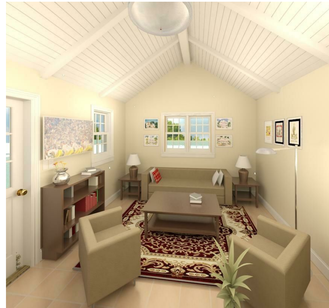
Living Room From Desk