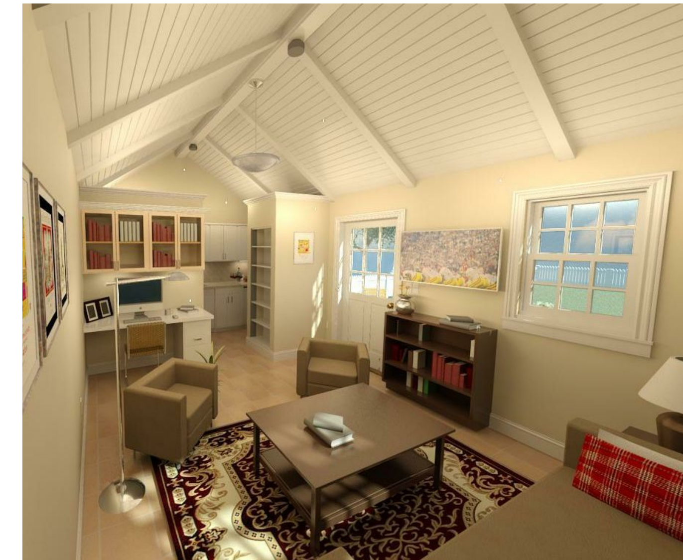
Interior View Front Door