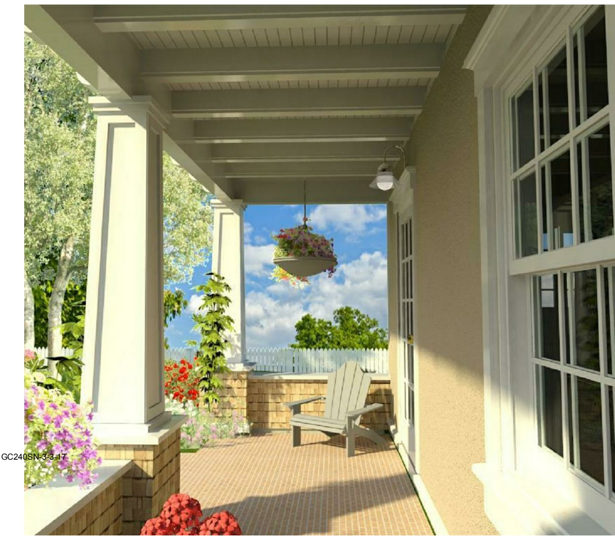
Porch View Craftsman Cottage