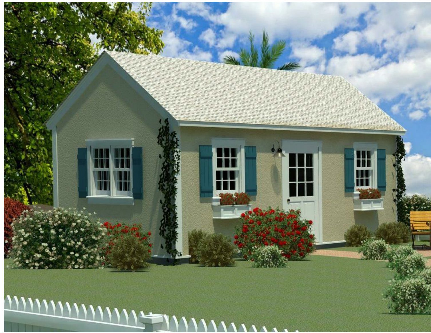
Front View 240sf Sonoma Cottage