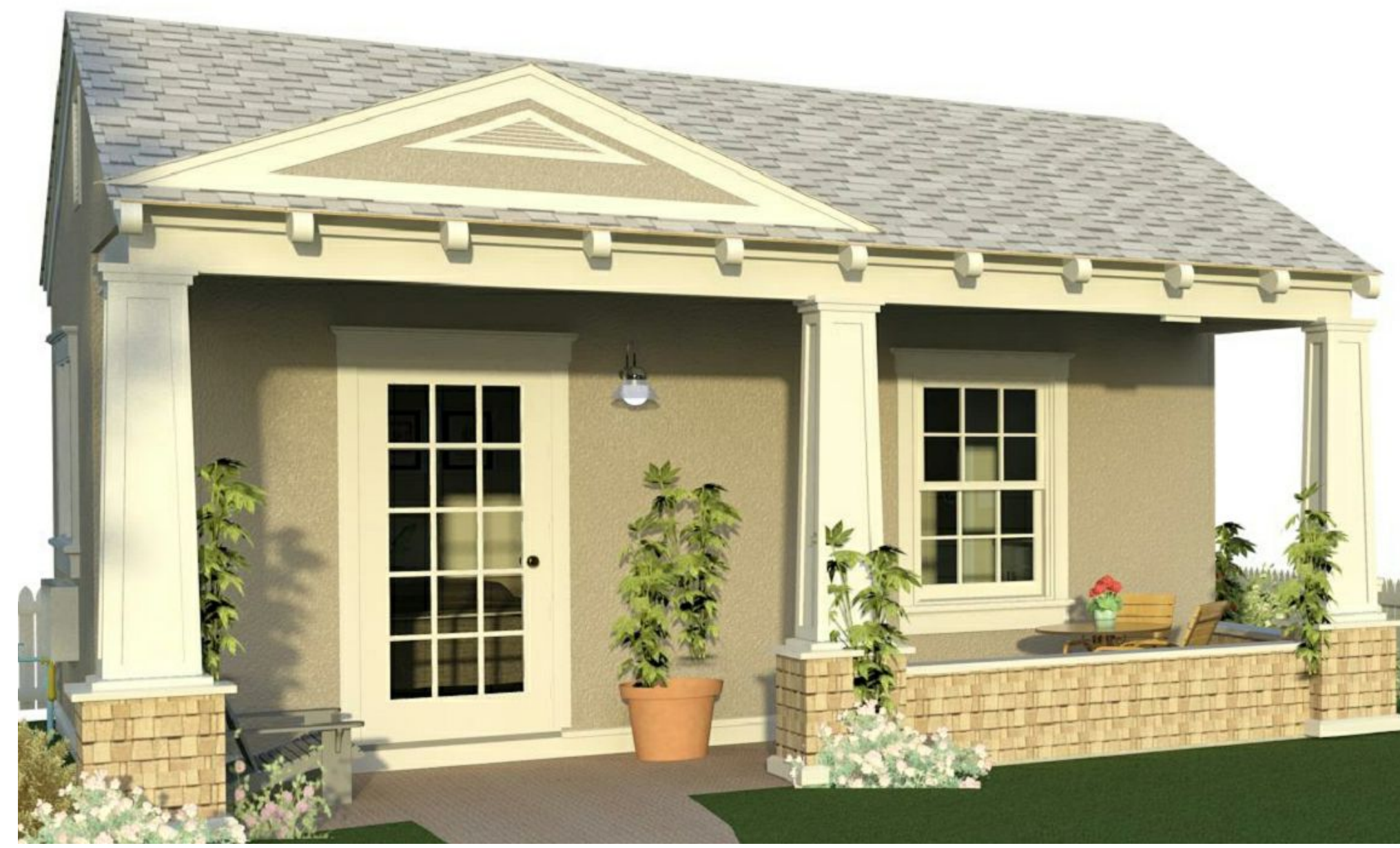
Front View as 240sf Craftsman Cottage