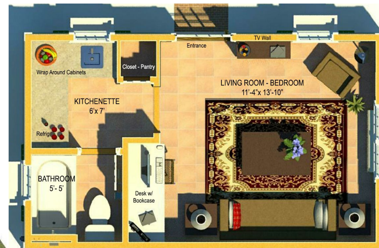
Floor Plan with Kitchenette