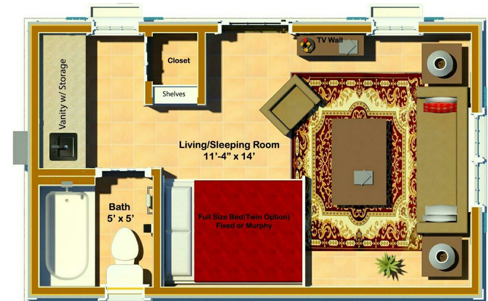
Floor Plan with Bed