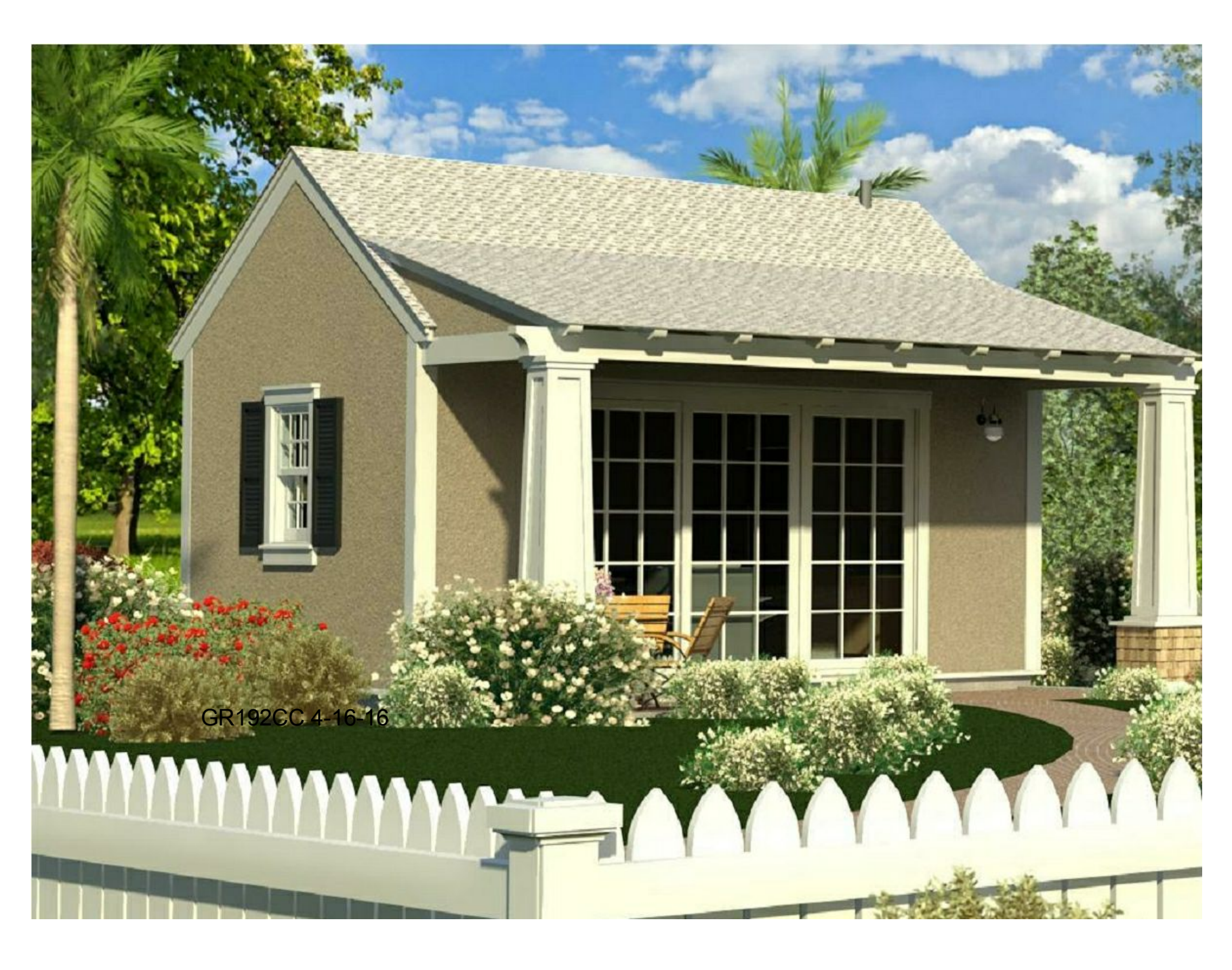
192sf COTTAGE AS CRAFTSMAN