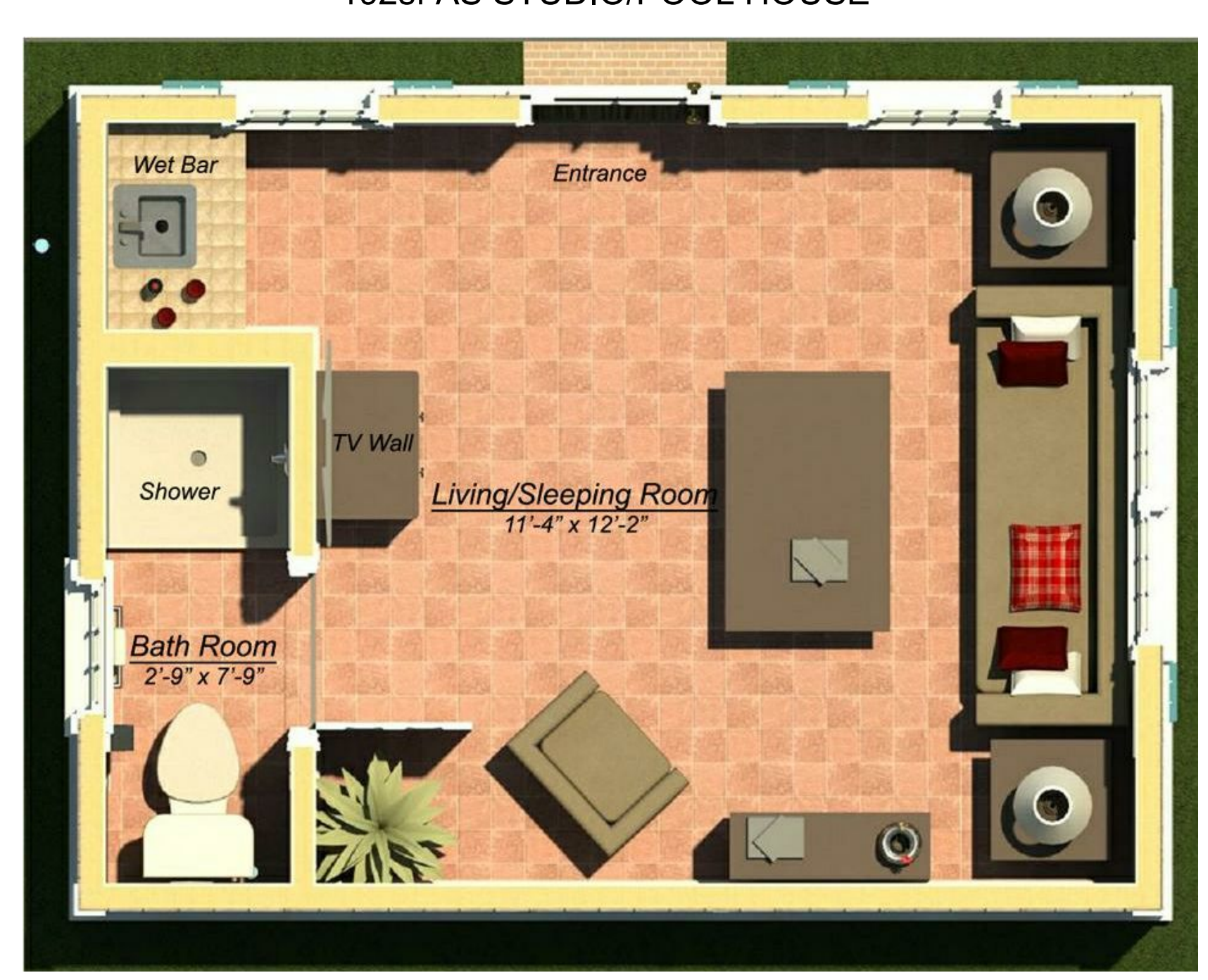
FLOOR PLAN as GUEST COTTAGE w/ SHOWER