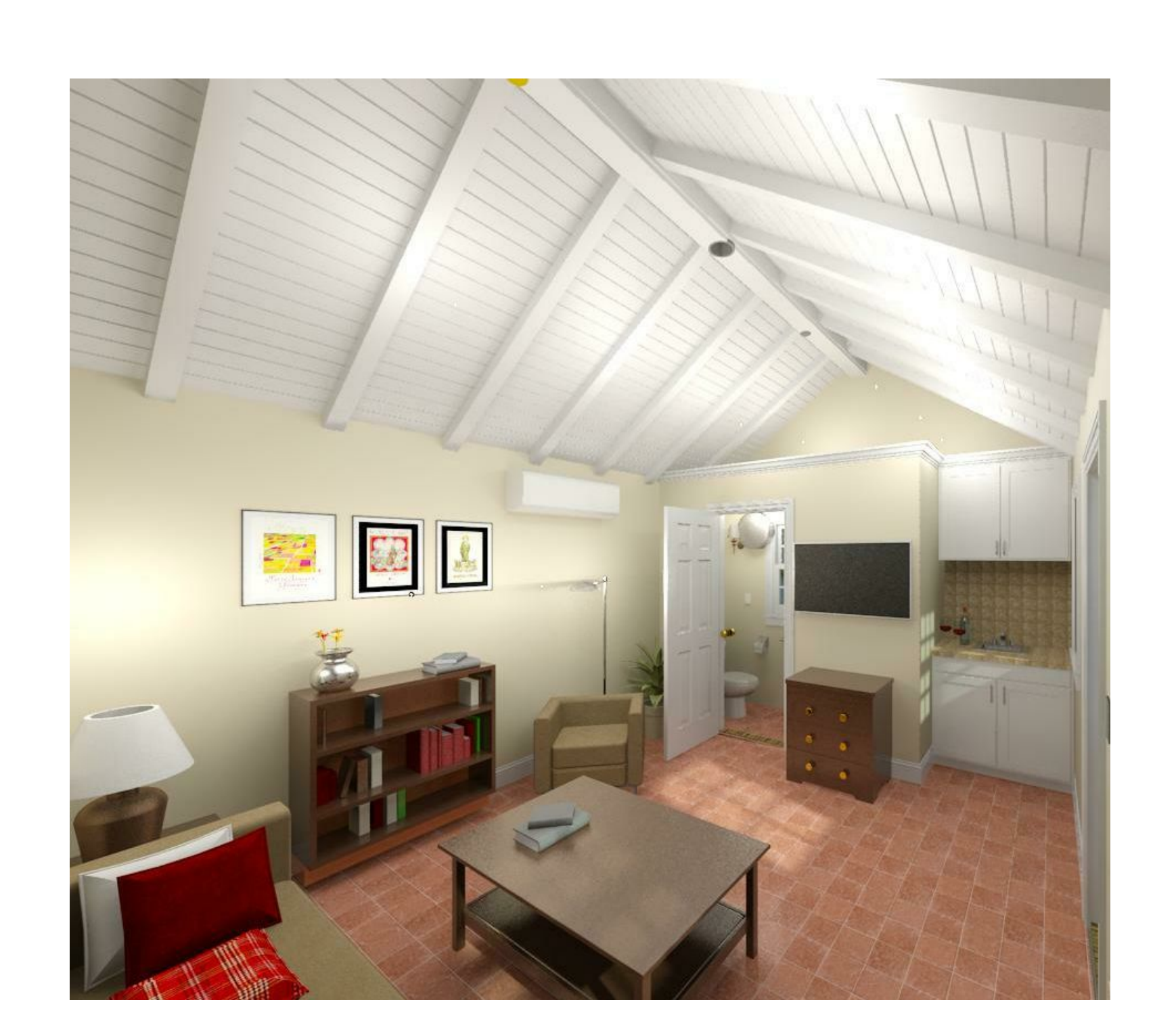
INTERIOR AS GUEST ROOM