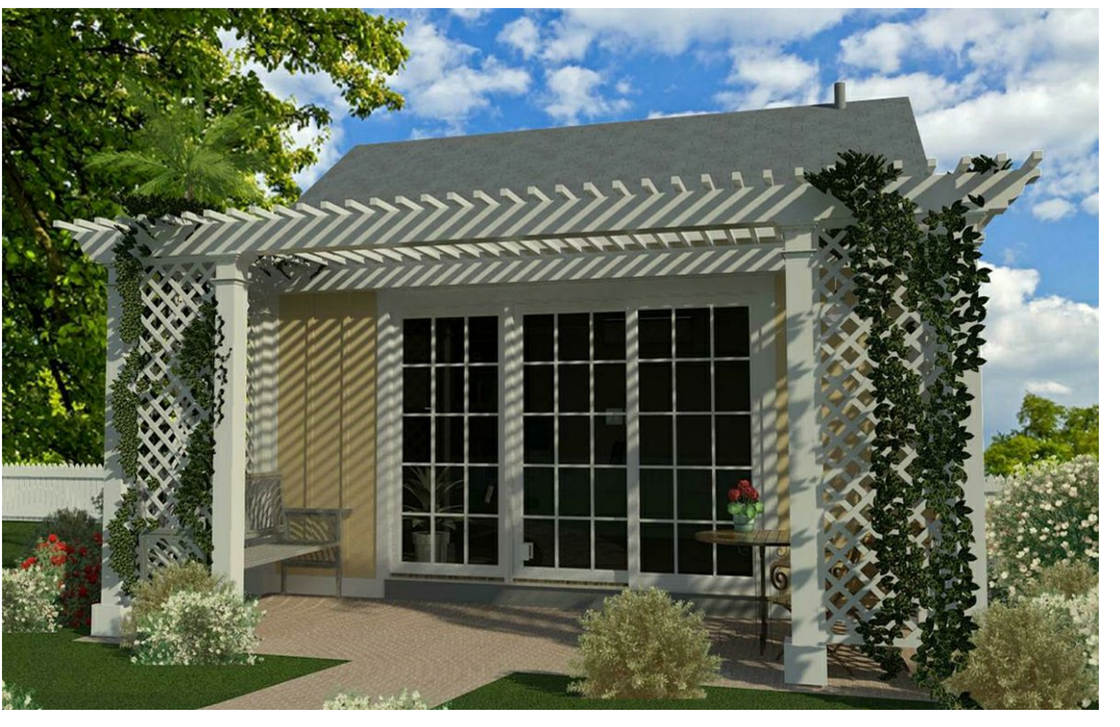
192sf AS STUDIO/POOL HOUSE