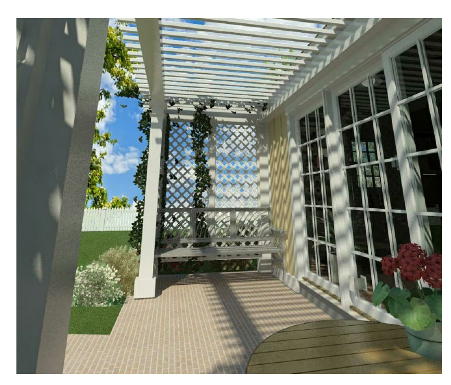
TRELLIS PORCH VIEW