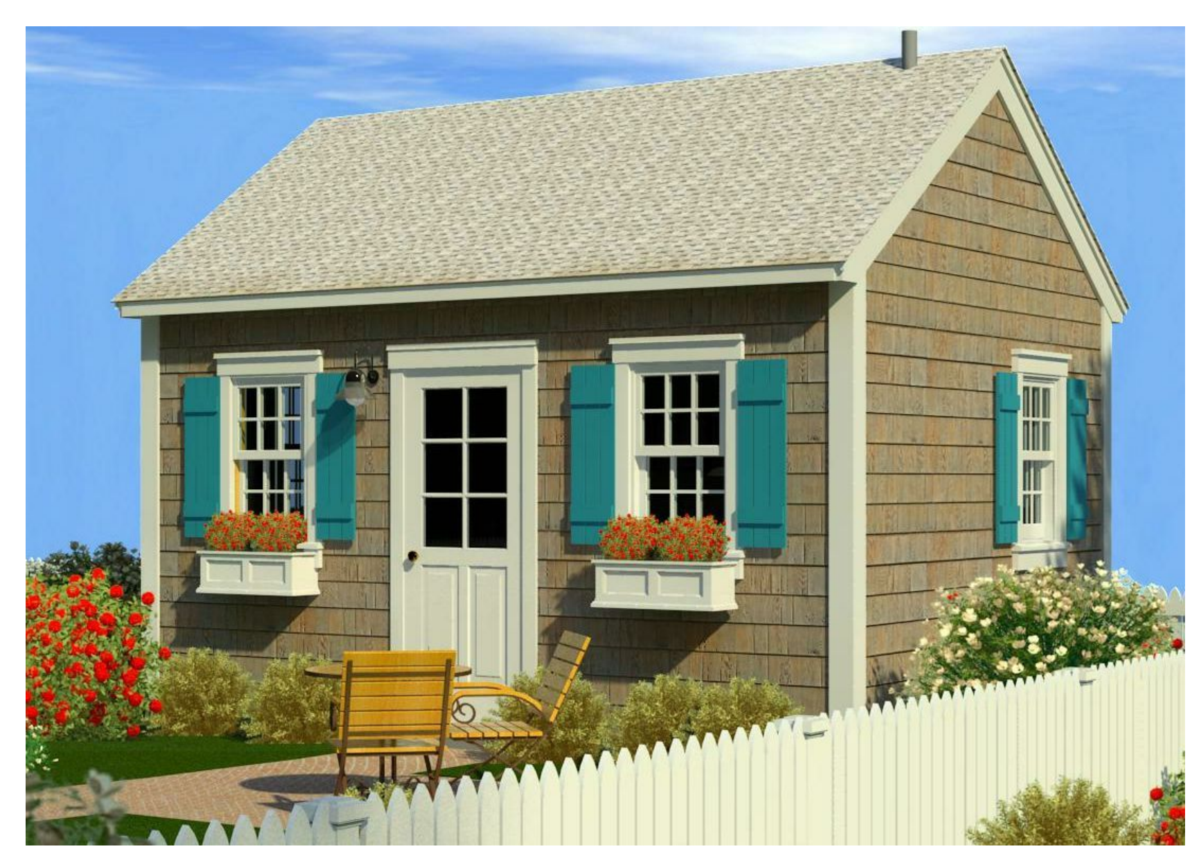
192sf CAP COD GUEST ROOM