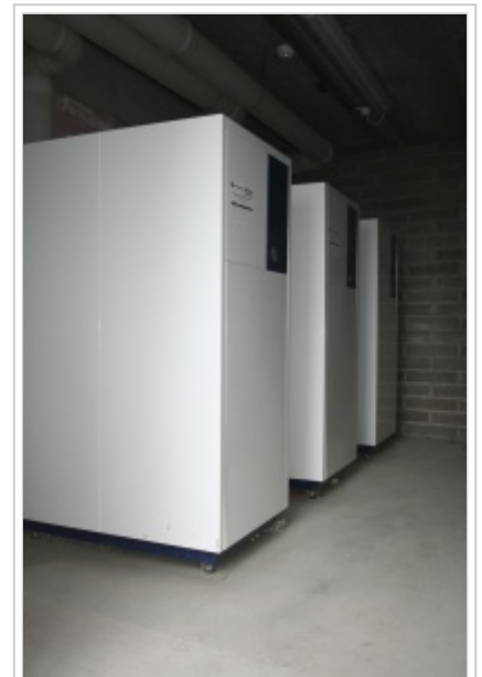
MHG Procon HT225

The Newbridge outlet was recently fitted with 2 x MHG HT225 and 1 x HT150 MHG condensing gas boilers containing a total of 8 x 75 kW boiler modules which can generate anything from 30 kW up to 600 kW of power. A built-in cascade manager optimises efficiency and ensures that the workload is evenly distributed among each of the heat exchangers. The original heat distribution system which consists of fan coils suspended