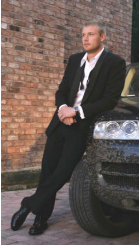
Andrew Flintoff England Cricket Captain