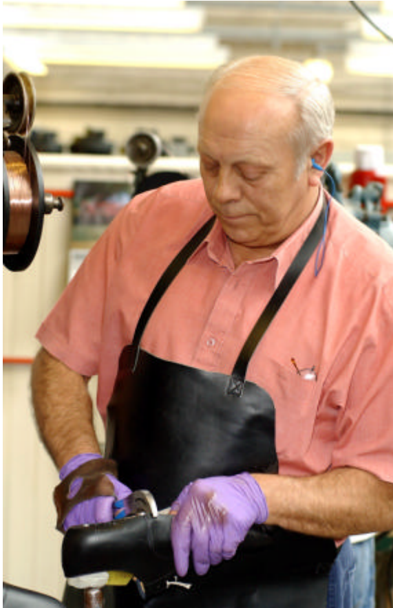
Side lasting by hand