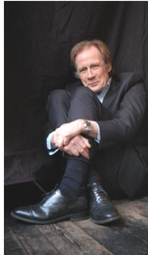
Bill Nighy Actor