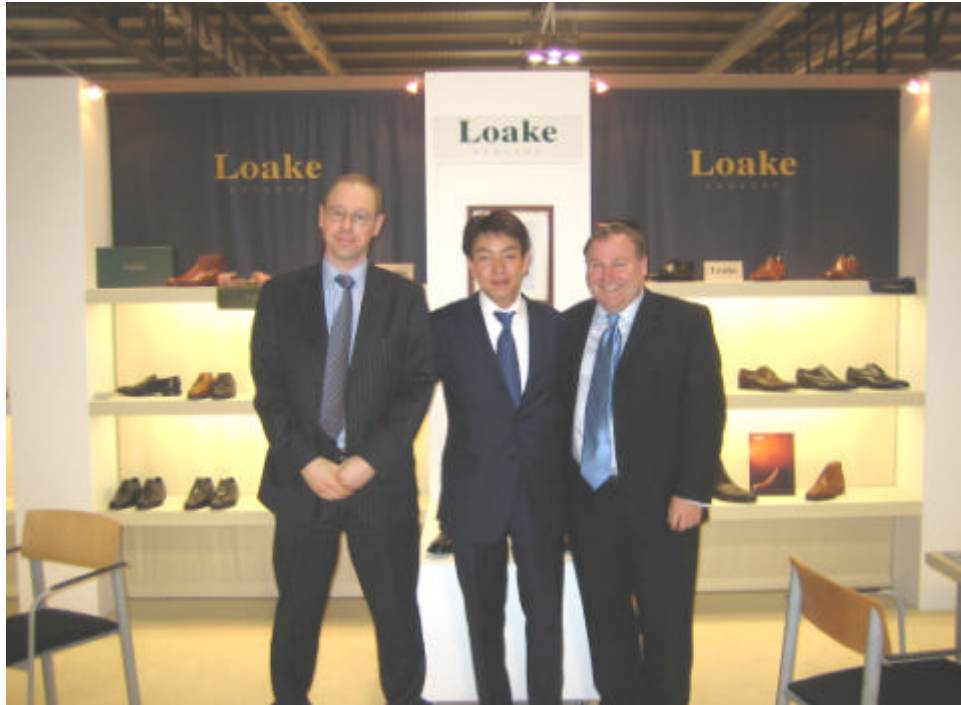
The Stand at Micam.

Loake exhibits at the major international trade fairs, including Micam in Milan.