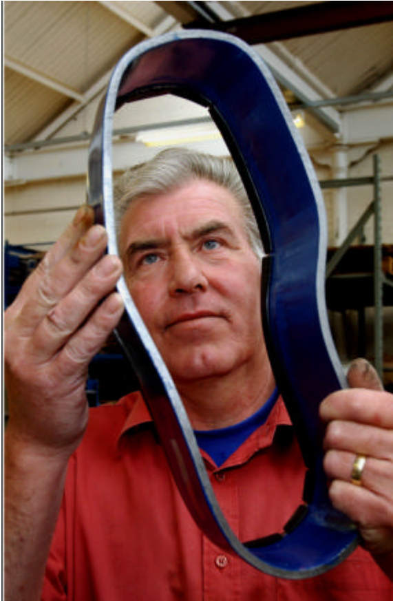
Loake cuts its own leather soles