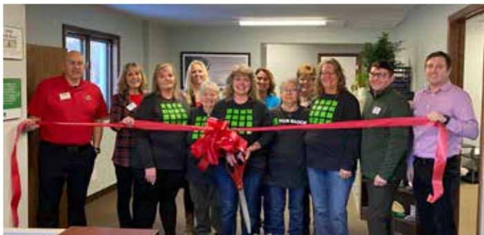
H & R Block 908 Dakota Ave S • (605) 352-2291