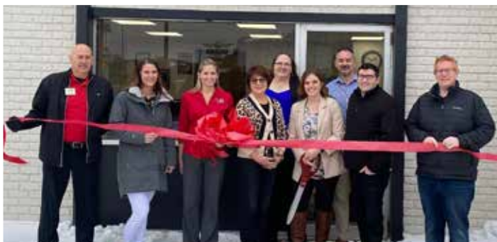
Legacy Financial Partners 2021 Dakota Ave S • (605) 352-0691