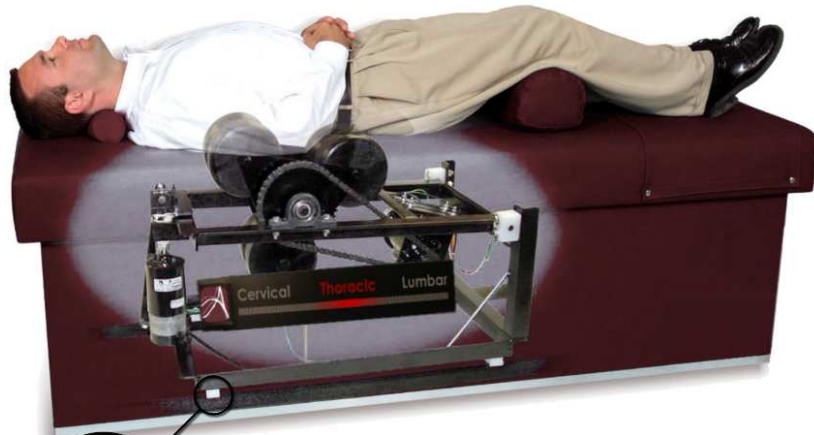
MODEL SHOWN: AMQ400