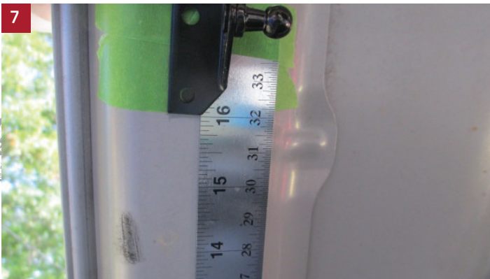
Mount the Ball Stud Bracket and tighten the Tec screws.