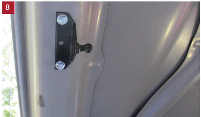
You are now ready to attach the strut.