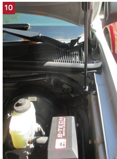
Side 2 completed. Installation completed.

You are finished with side 1. Repeat instructions for side 2.