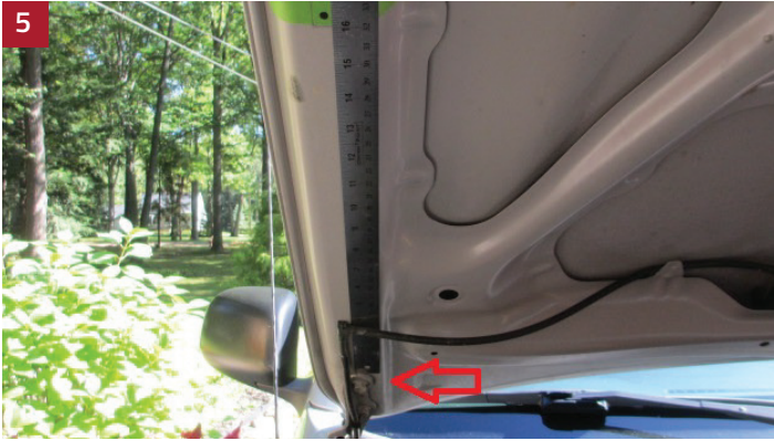
The upper Ball Stud Bracket mounts here.