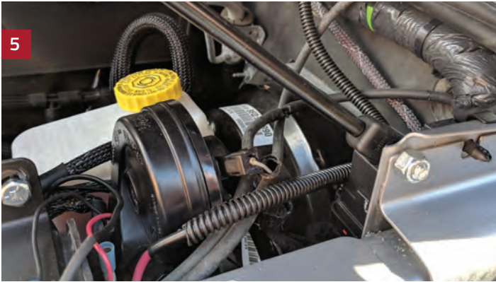
5 Attach strut to 10mm ball. Swing up strut to locate bracket position on hood.