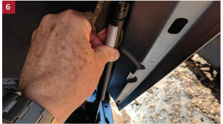
6 Use self strapping screws enclosed in the kit to attach bracket to hood.