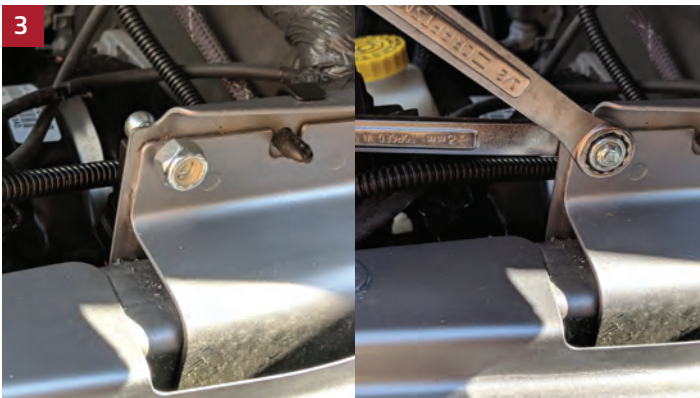
3 Mount 10mm ball stud and tighten.