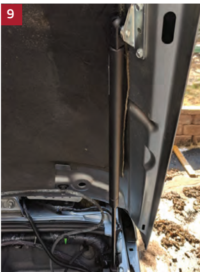
9 Attach strut.

You are finished with side 1. Repeat instructions for side 2.