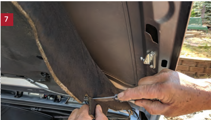
7 If your Jeep has an insulation kit, trim back insulation away from bracket.