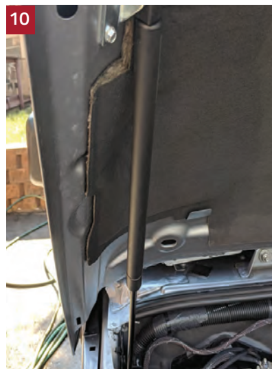
10 Side 2 completed.

You are finished with side 1. Repeat instructions for side 2.