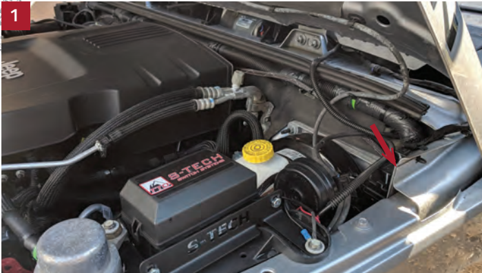
1 Bottom 10mm ball stud mounts here.