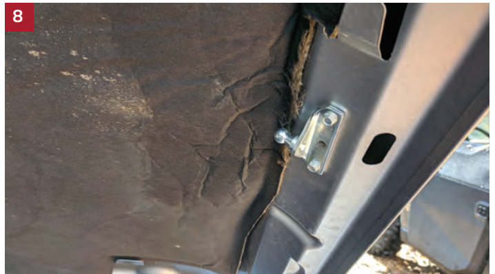
8 You are ready to attach the strut.