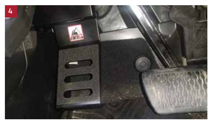
Install the assembled dead pedal over the 1/4" bolt from the backing plate and loosely install 1/4" flat washers, nuts on the bolts.