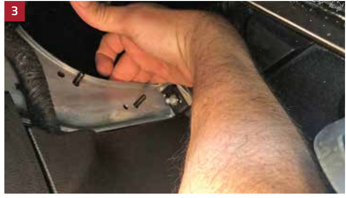
Pick one of the 3 locations on the mounting plate and install the tabs of the dead pedal bracket into the mounting plate. Then, fasten the mounting plate to the dead pedal bracket by installing the 5/16" bolt into the countersunk hole in the backside of the mounting bracket and secure the bolt with flat washer. Lock washer and nut.