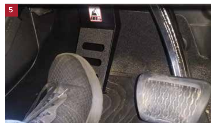
Test fit the dead pedal with your foot to make sure it is located where you want it to be. Make any necessary adjustments and once it is where you like it, tighten the nuts.