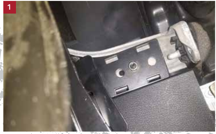
Open the driver's side door and find the metal reinforcement plate above the plastic kick panel.