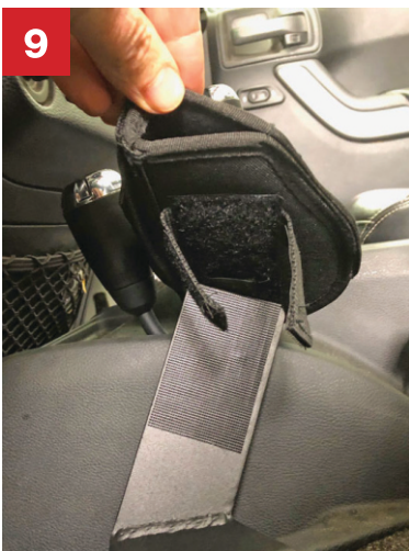
9 To install the T3 Holster, slide the back flap down along the center console side of the T3 Pistol Mount and press against the outer hook & loop pad and wrap the two smaller flaps around and press to lock their hook & loop pads firmly securing the holster to the T3 Pistol Mount.