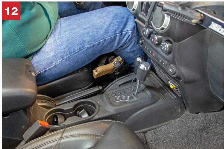
12 The T3 mount angles the pistol back 22° and sits at a 10° offset angle. This allows it to sit out of the way enough that you don't even know it is there. Even for a big tall person like Maxx, our Sales/Counter guy at the Silverdale, WA store.