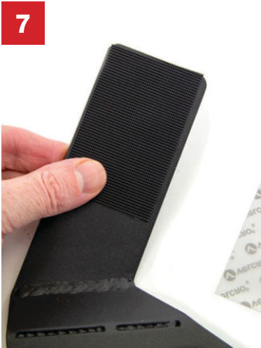
7 Apply the included hook and loop adhesive pads to the T3 Pistol Mount. To match the holster pads, we installed the hook pad to the outside of the bracket, the side closest your leg.