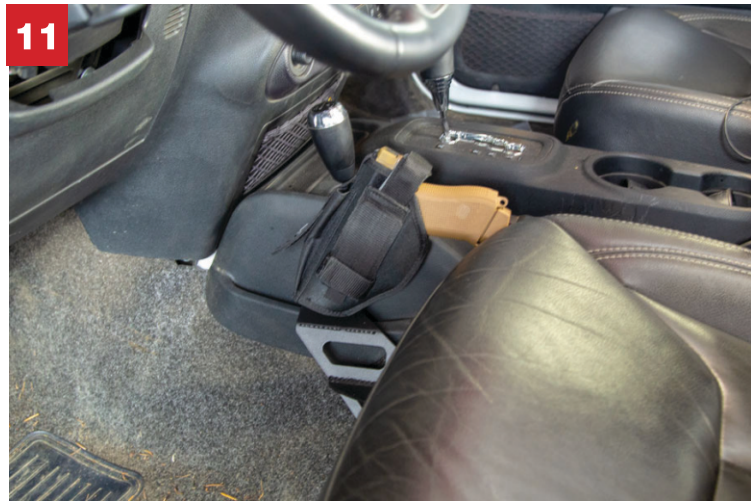
11 We set a Glock 19X in the holster for pics. The pistol fits beautifully and the thumb strap holds the pistol securely in place for those rough roads. The Universal Nylon Holster included with the T3 Tactical Mount is adjustable to fit many different models of pistols, from .380 to 9mm to .45. However you can use your favorite holster, including Kydex models, if you choose.