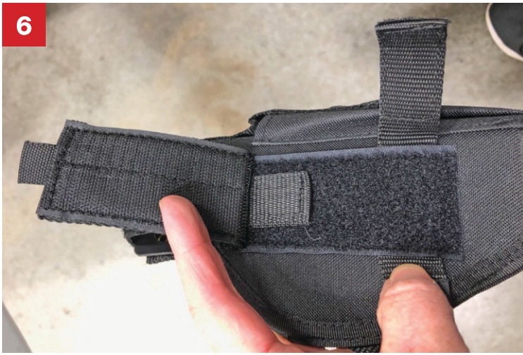
6 The back side of the S-Tech T3 Holster has hook and loop (Velcro) pads sewn in.