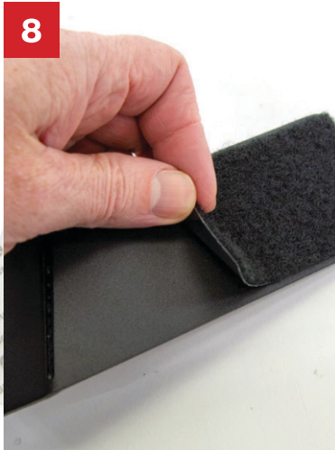
8 And we installed the loop pad to the inside of the bracket, the side closest the center console.