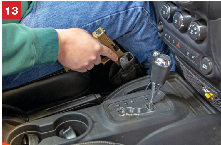
13 The mounting placement also allows for a fast draw. Just drop your hand down from the steering wheel and your hand rests naturally on top of the pistol. Then peel up the thumb strap and the pistol smoothly out of the holster.