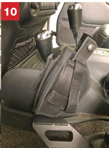
10 Lower the holster down against the outside of the T3 Pistol Mount and press in to lock the outer hook & loop pad and wrap the two smaller flaps around and press to lock their hook & loop pads firmly securing the holster to the T3 Pistol Mount.