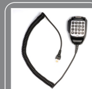
Keypad microphone SM07R1