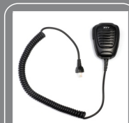
Palm microphone SM07R2