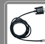
Programming cable PC21