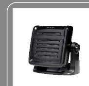
External speaker SM09S2