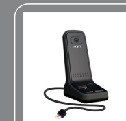
Desktop Microphone SM10R2