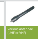
Various antennae (JHF or VHF)