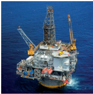
Oil and gas

To ensure easy use of our products and good functions for all environments we use advance technology such as Level Dependent technology and Bluetooth®.