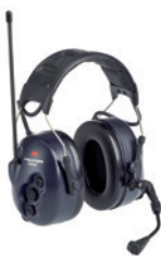
3M™ PELTOR™ LiteCom