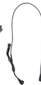
3M™ PELTOR™ MT53V/1 (ELECTRET)