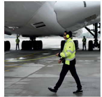
Airport ground handling