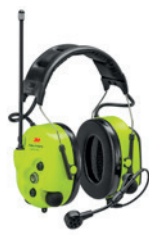
3M™ PELTOR™ LiteCom Plus