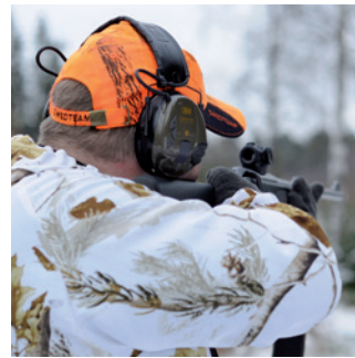
Hunting and sport shooting