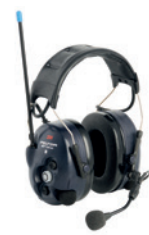
3M™ PELTOR™ WS™ LiteCom Plus