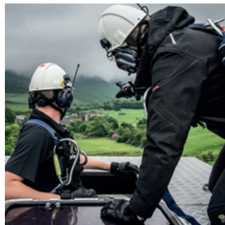
Energy and utilities