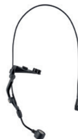
3M™ PELTOR™ MT7V/1 (DYNAMIC)