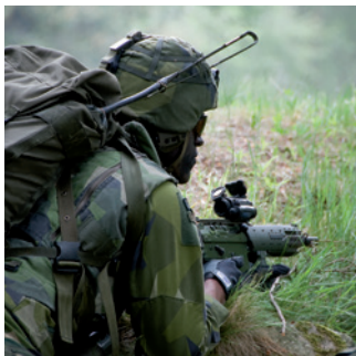
Military and law enforcement