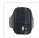
BT wireless ring PTT