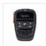
BT Wireless remote speaker microphone