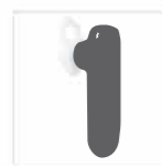
BT Wireless earpiece