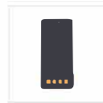
2000mAh Li-polymer Battery