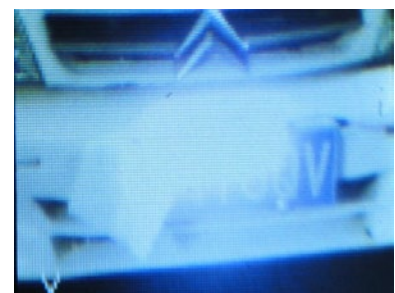
As seen from an IR CCTV Camera