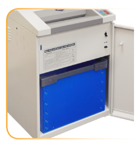
Heavy Duty Waste Bin