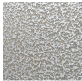
Parchment Texture (PT)