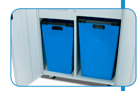
Lifetime guaranteed waste bins made of heavy-duty molded plastic