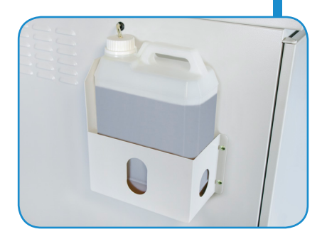
EvenFlow<sup>™</sup> Automatic Internal Oiling System