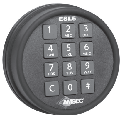
ESL5 Electronic Lock for FS1814E5 Safes only

To open the battery compartment on the ESL5 lock, twist the lock face to the left and remove. The battery is located inside the lock.