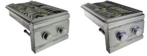
Cutlass Pro Double Burner - RDB1 / *RDB1EL

Two 12,000 BTU burners with removable lid. 304 Stainless Steel. *LED blue lights. Transformer included. RSSG2 fits.