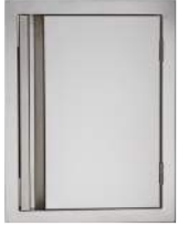
Vertical Door - VDV1

Our sleek line of Valiant series doors and drawers have everything you could want. They enhance the design and function of your outdoor kitchen. Double wall lined, 304 stainless steel, doors open fully, non-protruding handles and all doors and drawers have a lifetime warranty!