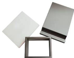
Trash Chute & Cutting Board - VTC1

Cutting board & chute with removable stainless lid included.