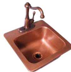
Copper Sink - RSNK3

Single handle bronze faucet, strainer, 16-gauge copper sink, hot & cold water.