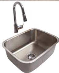
Stainless Undermount Sink - RSNK2

Single handle pull-down faucet, strainer, 360° swing angle, 18-gauge, hot & cold water.