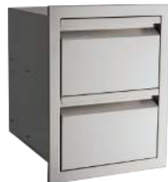
Double Drawer - VDR1