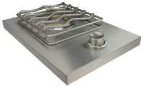
Cutlass Pro Single Burner- RSB1

Two 12,000 BTU burners with removable lid. 304 Stainless Steel. *LED blue lights when installed with Cutlass Pro Series Grills. RSSG2 fits.