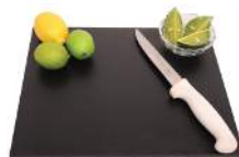
Cutting Board - RCB1

Cutting board & chute with removable stainless lid included.