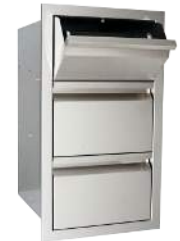
Double Drawer Combo - VTHC1