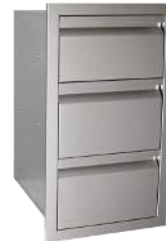
Triple Drawer - VTD3