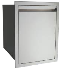
Double Trash Drawer - VTD2