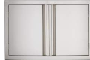
Double Door - VDD1