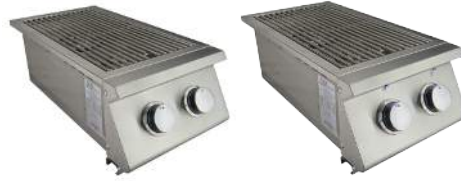
Premier Double Burner - RJCSSB / *RJCSSBL

Two 30,000 BTU burners with removable lid. 304 Stainless Steel. LED blue lights. Wok ring & power transformer included. RSSG1 fits.