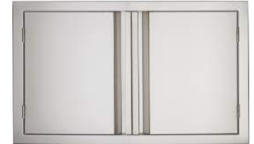
Large Double Door - VDD2