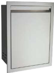
Trash Drawer - VTD1

Fully enclosed soft close drawer unit. With paper towel holder