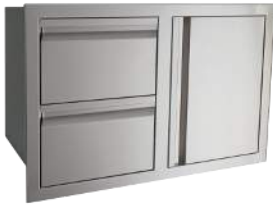
Double Drawer/Door - VDC1