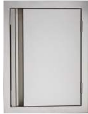
Large Vertical Door - VDV2