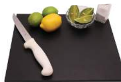
Cutting Board - RCB2