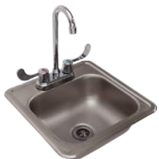
Stainless Sink - RSNK1

Double faucet, strainer, hot & cold water.