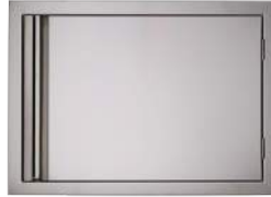
Horizontal Door - VDH1