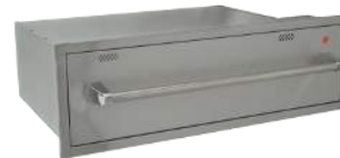
Warming Drawer - RWD1

Includes two 13 gallon bins for trash & recycling. *Not soft close