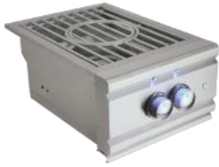
Cutlass Pro Power Burner - RSBB