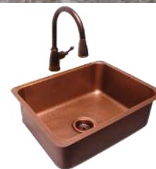
Copper Undermount Sink - RSNK4

Single handle pull-down faucet, strainer, 360° swing angle, 16-gauge copper sink, hot & cold water.