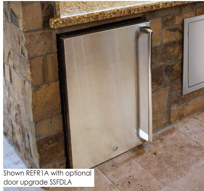
Shown REFR1A with optional door upgrade SSFDLA