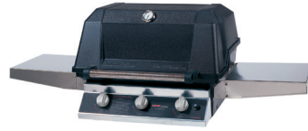
Overall Dimensions (without shelves) 26-3/4" W x 19" H x 24-1/2" D

All grills are available in natural or propane gas LP hose & Regulator available on LP grill models only