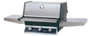
Overall Dimensions (without shelves) 26-3/4" W x 19" H x 25" D