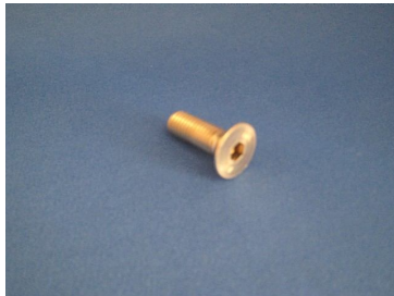
2 Long Screws