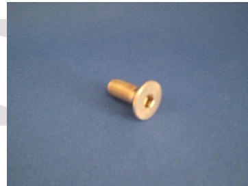
2 Short Screws