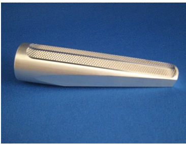
2 Custom Foot Pegs