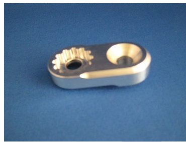
2 Extension Arms