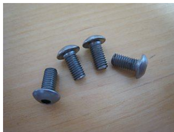
4 M-5 Screws (provided)

Main Plate 2 Posts 2 Phillips Large Screws 4 Phillips Small Screws