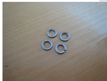
4 washers (from TomTom RAM kit)

These screws and washers will be used to attach the TomTom mount to our GPS Mount