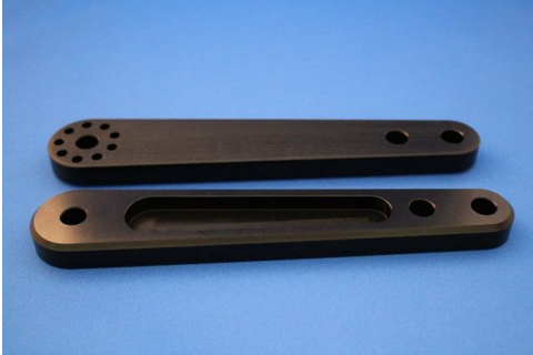
2 Mount Arms