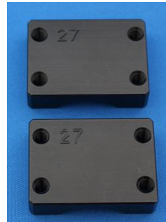
2 Back Clamps