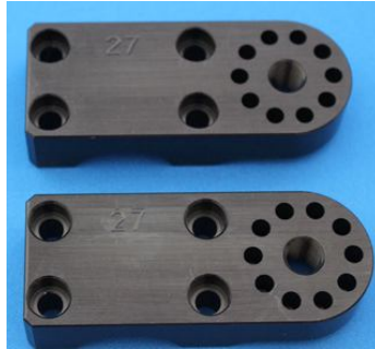
2 Front Clamps