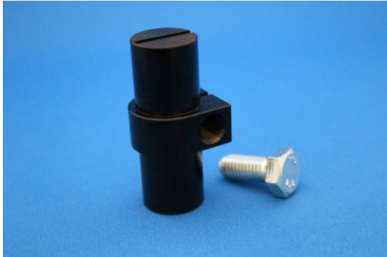
Kickstand Insert - black M8 Screw