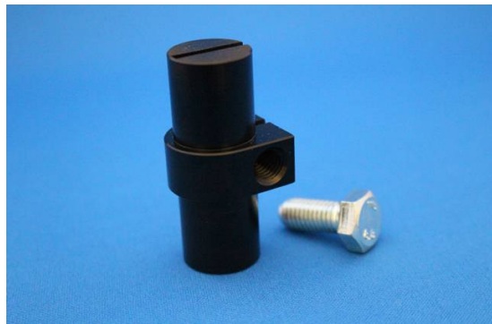
Kickstand Insert - black M8 Screw