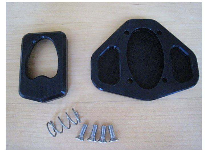
PARTS : bottom plate, top plate, a spring, and 4 screws