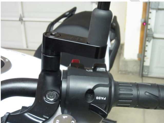
Left side* installed *extender with Moto Werk logo