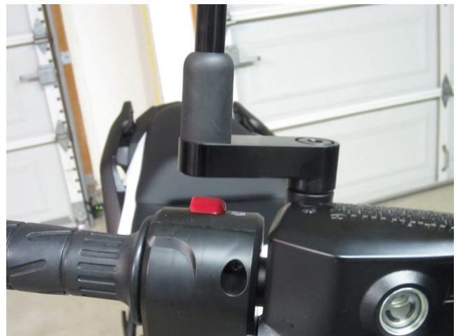
Right side installed