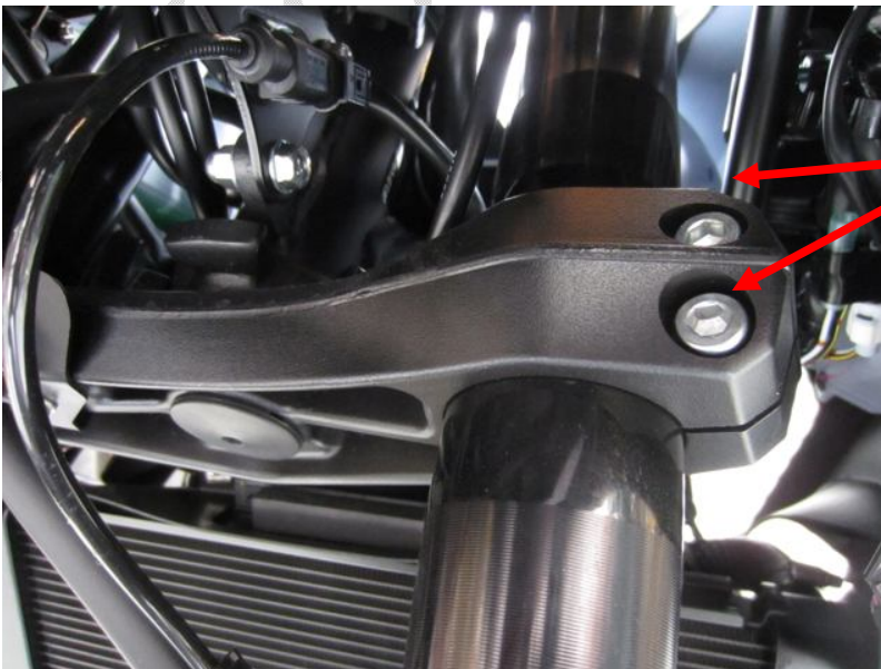
Lower triple clamp socket head cap screws