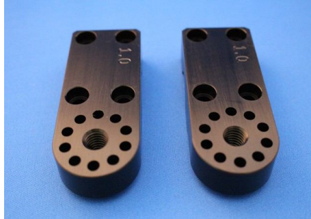
2 Front Clamps