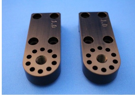
2 Front Clamps