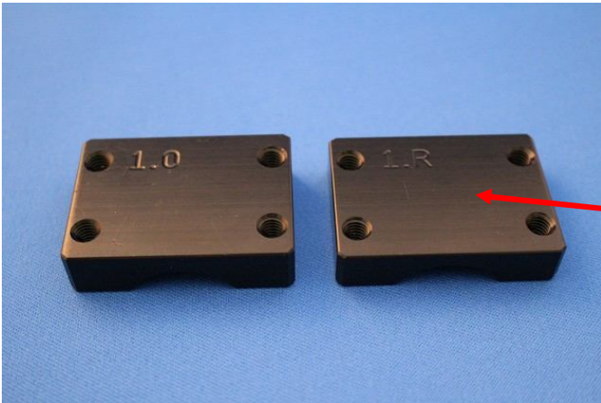
Left Back Clamp (1.0) &