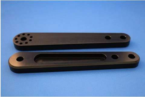
2 Mount Arms