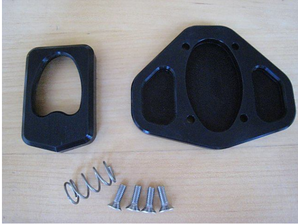
PARTS: bottom plate, top plate, a spring, and 4 screws