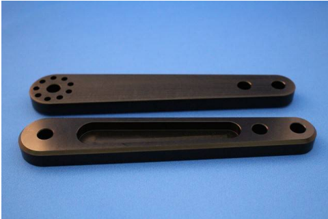
2 Mount Arms