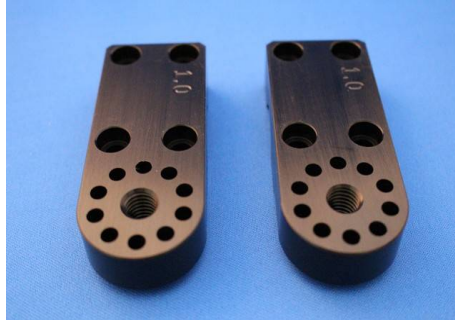
2 Front Clamps