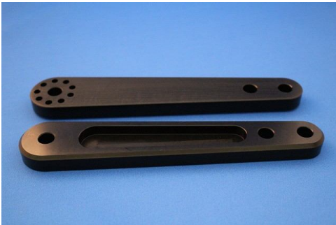
2 Mount Arms