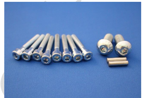
Bolts and 2 Dowel Pins