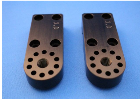
2 Front Clamps