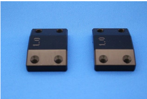
Back Clamps (Revision 2)