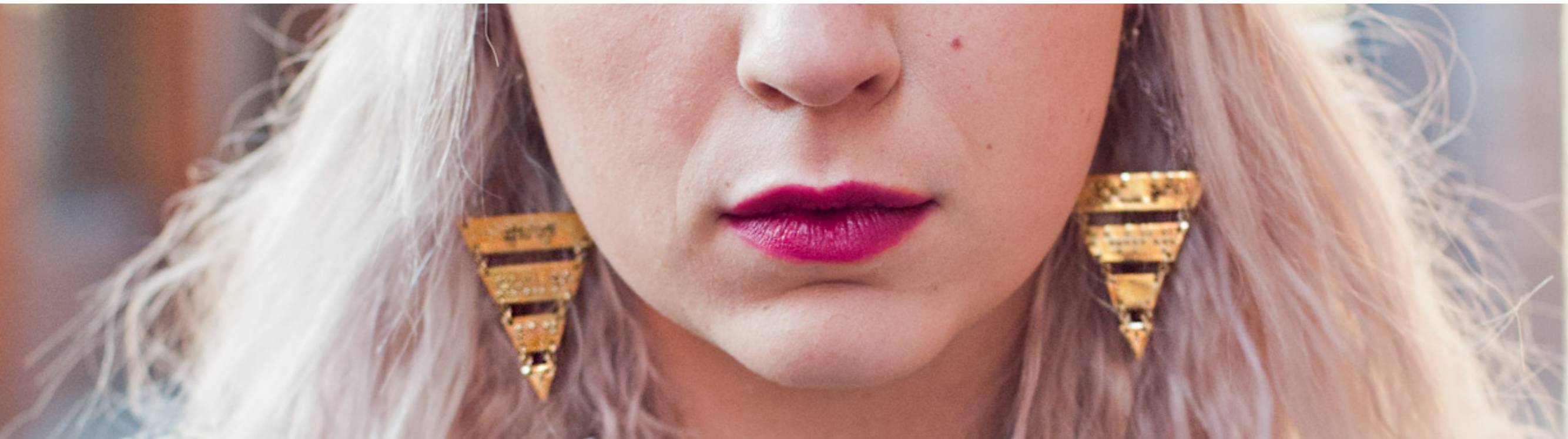
JAN earrings 'when you're bad you're better'