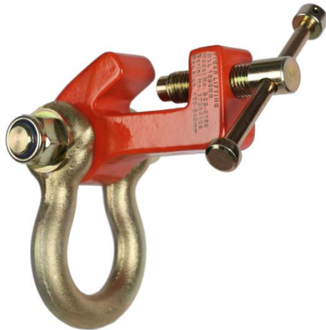
1.5t unit (BCB-0150)