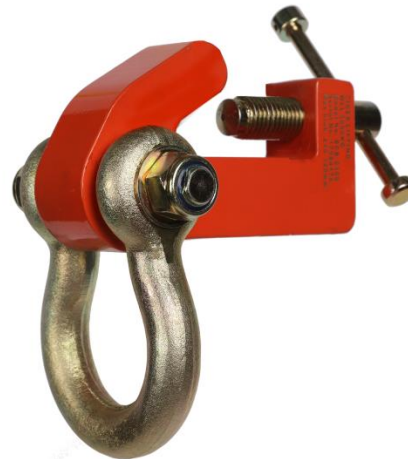
3t unit (BCB-0300)